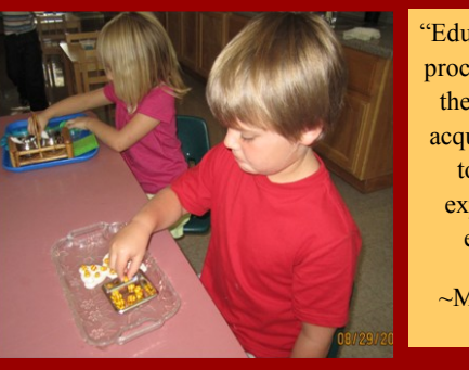
"Education is a natural process carried out by the child and is not acquired by listening to words but by experiences in the environment."

California Montessori Project Shingle Springs was awarded Charter School Facilities Funds under Proposition 55. The school is currently negotiating the purchase of an additional contiguous parcel with plans to build 14 classrooms, a multi-purpose room, and administrative offices. This would allow us to expand our student enrollment and remove some of the portable classrooms that are in place on our current campus. We are eagerly awaiting the State's release of the next phase of the design and implementation funds for this project.