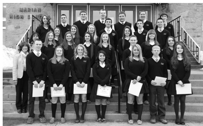
2014 Language Honor Inductees