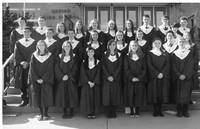
2013-2014 National Honor Society Inductees