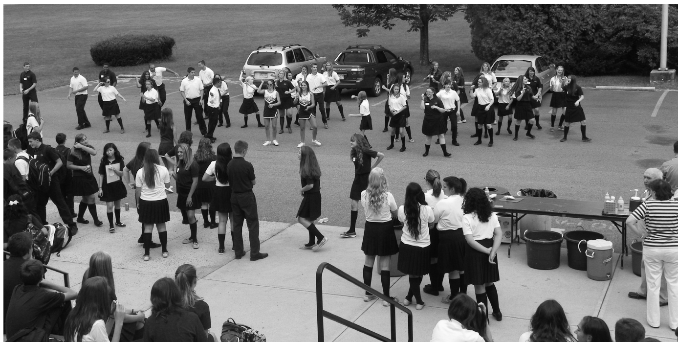
Freshman Orientation Day

Students and faculty at Marian Catholic High School made a donation to three area non-profit organizations following