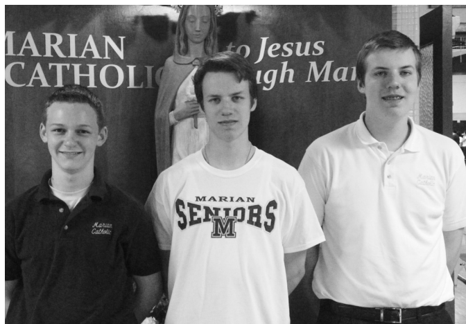
Students Receive Awards At Junior Academy of Science