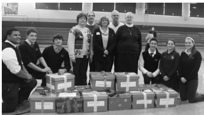
Catholic Schools – “Communities of Faith, Knowledge, and Service – In our Students”

special student seminars detailing the progress and activities of these organizations. Speakers from Access Services and Catholic Charities spoke to the student body.