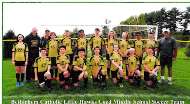
Bethlehem Catholic Little Hawks Coed Middle School Soccer Team

Bring your water bottle, soccer cleats and shin guards. Turf is located behind the grass soccer field