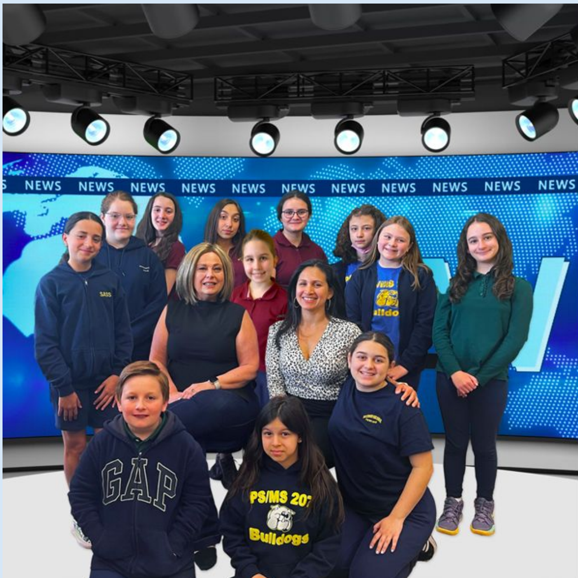
Rockwood Park News Staff

I think journalism is a great way to do public service, to have an impact on your community – Bob Schieffer