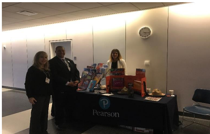
Our event sponsors from Pearson