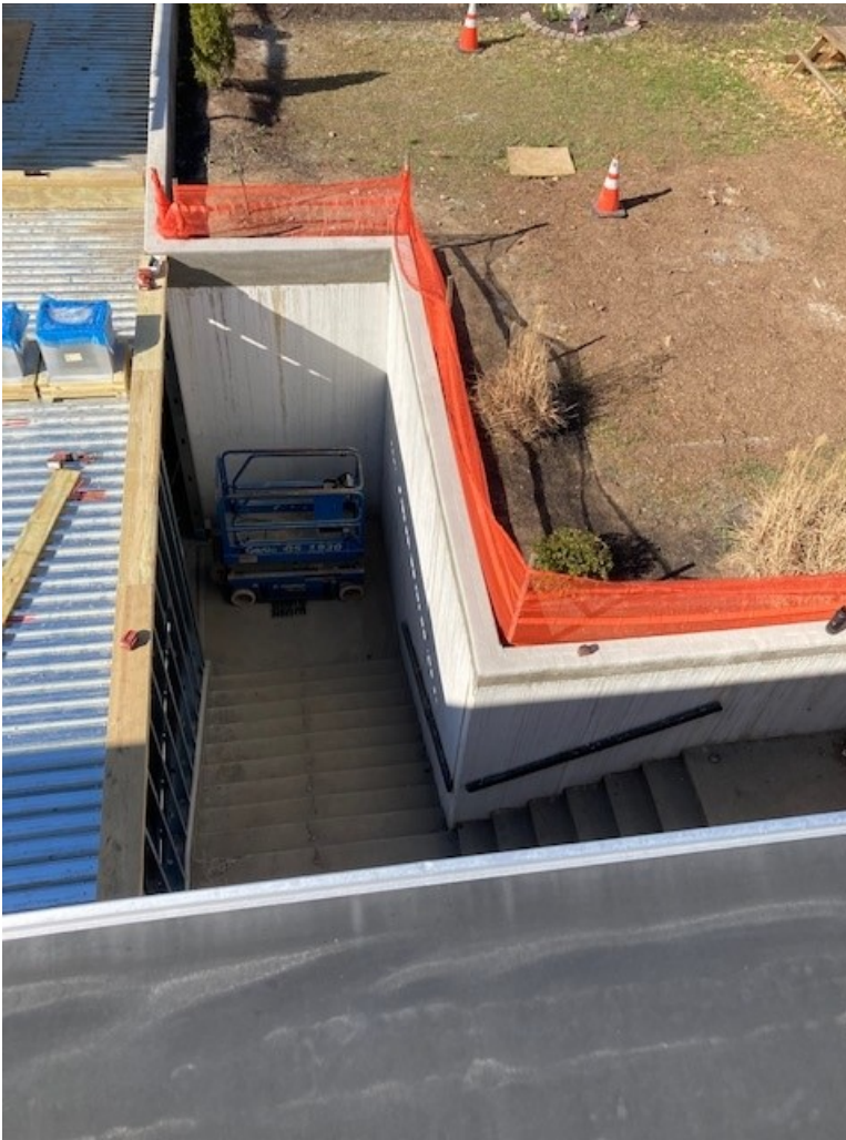
Week 46 – Courtyard work