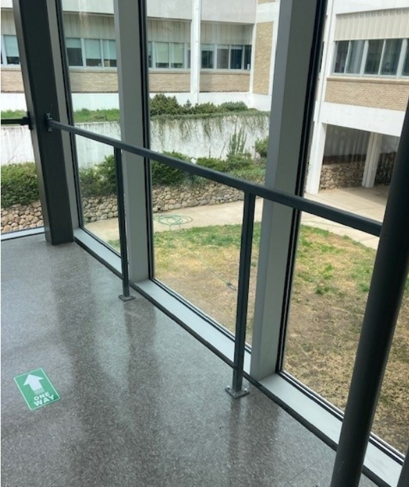
Week 48 – Landing railings placed within Stair Tower

1 Week Update – Week 48 (April 19 thru April 23, 2021)