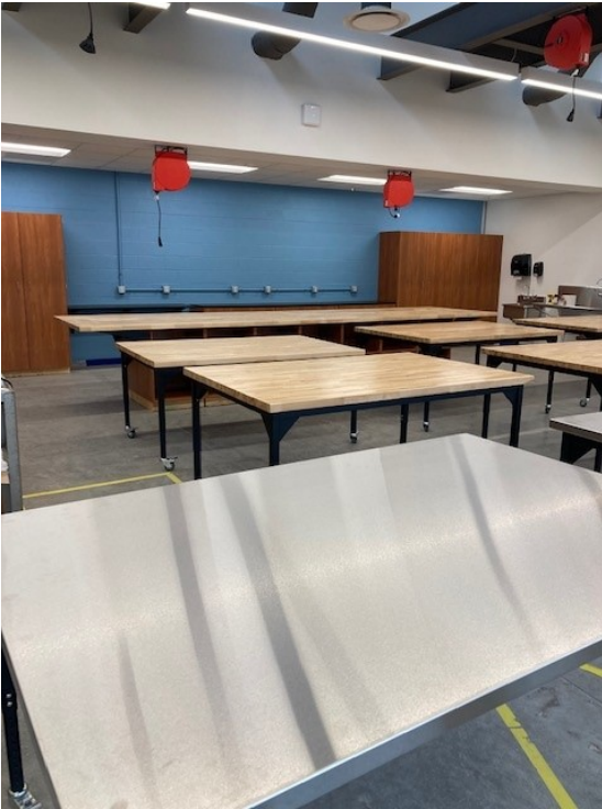
Week 46 – Furnishings & Casework for Art Room 307 Addition

1 Week Update – Week 46 (April 5 thru April 9, 2021)