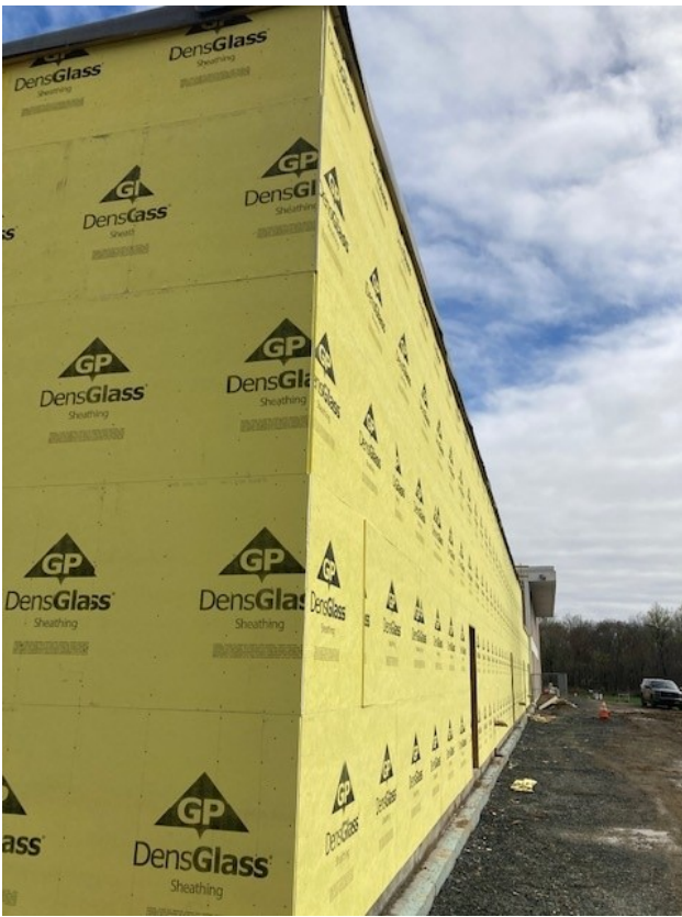
Week 47 – Exterior sheathing boards installed on Music Wing addition