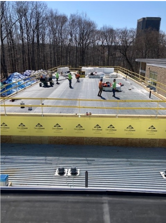
Week 46 – Upper Roof area over Music Wing