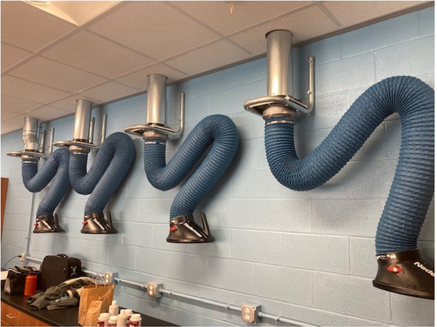
Week 47 – Retractor Arm exhaust vents for Art Room 307 Addition

1 Week Update – Week 47 (April 12 thru April 16, 2021)