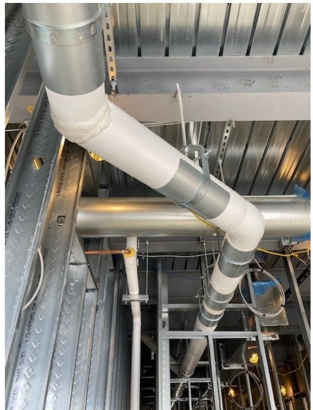
Week 48 – Installation of insulation for plumbing work in Music Wing