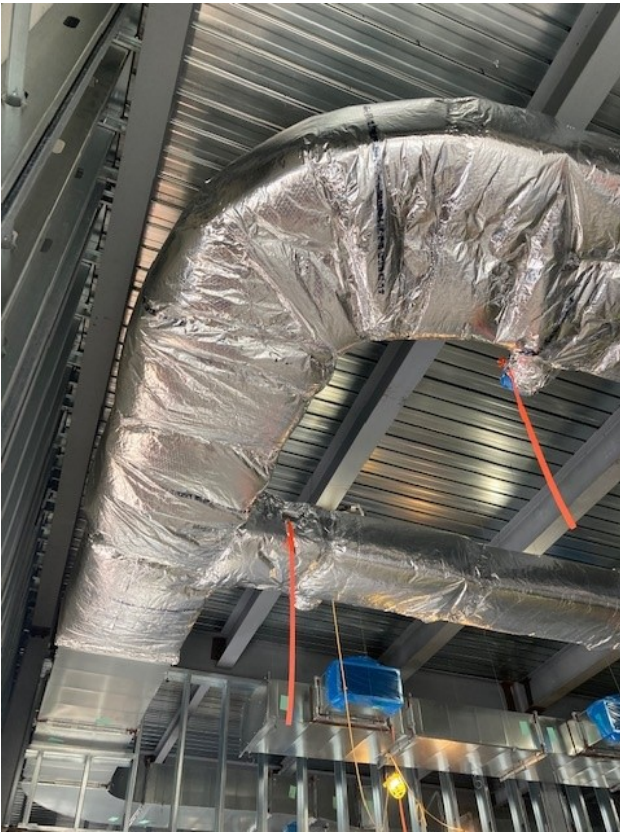
Week 48 – Installation of insulation on ductwork for Music Wing