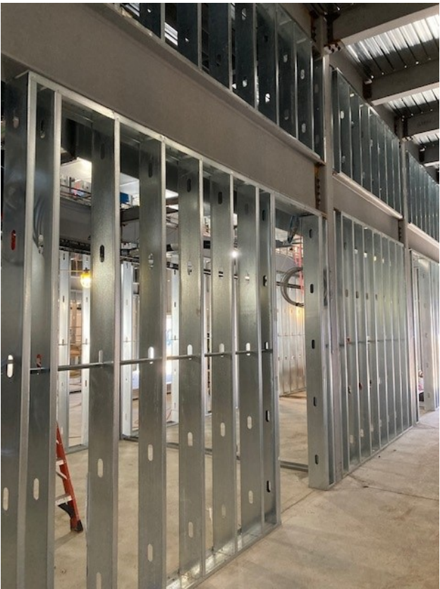
Week 47 – Interior framing in Music Wing addition underway