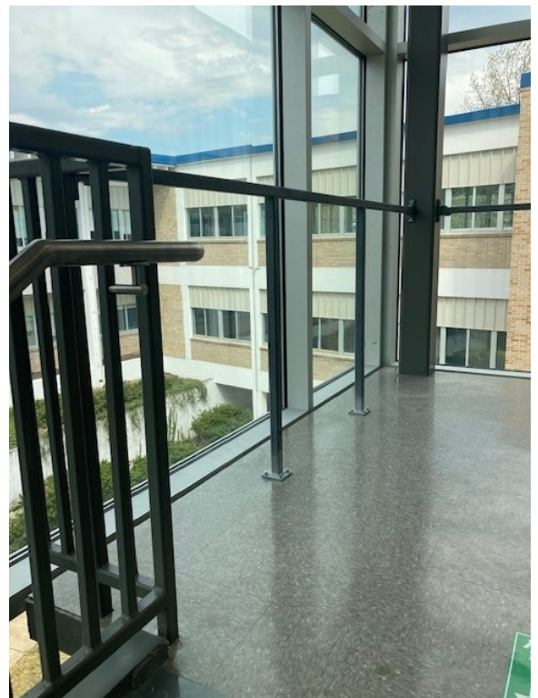
Week 48 – Landing railings in Stair Tower