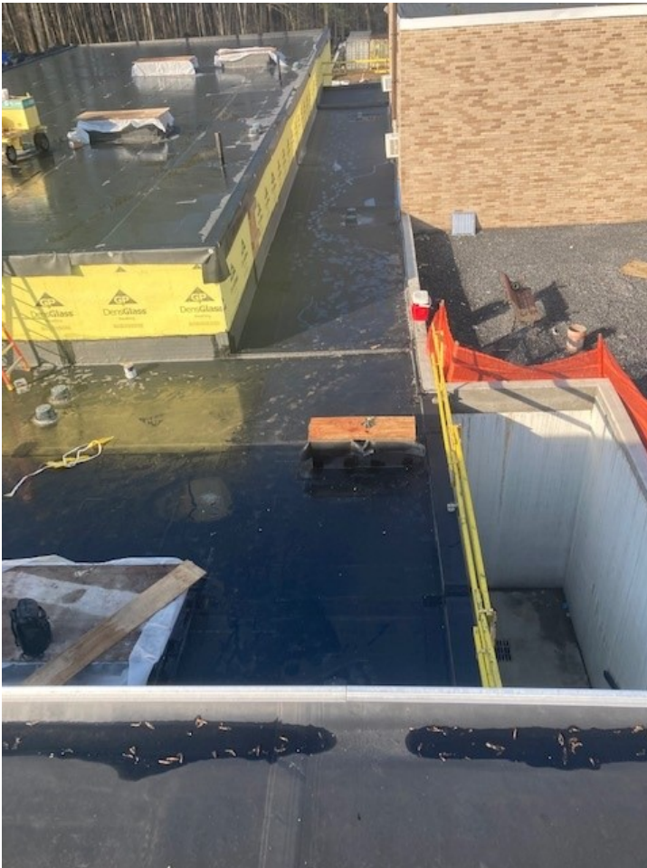
Week 48 – Continuation of the roofing work for the Music Wing