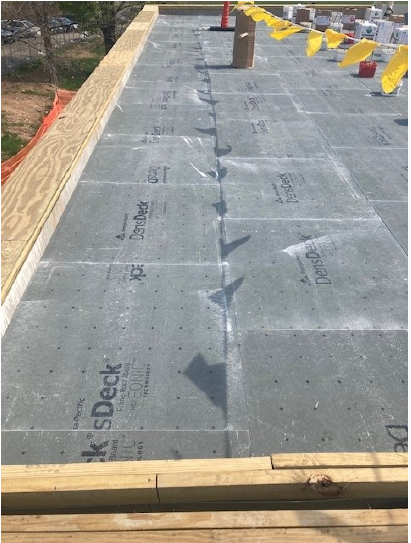
Week 48 – Roof boards installed over the Gym addition