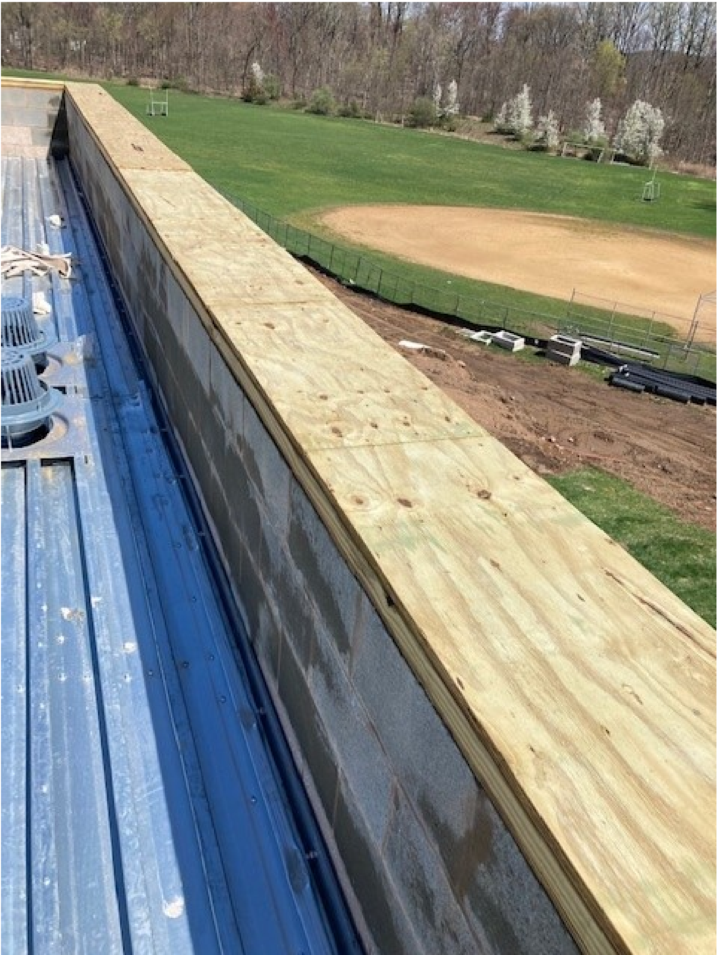
Week 47 – Parapet for Gym addition roof being constructed