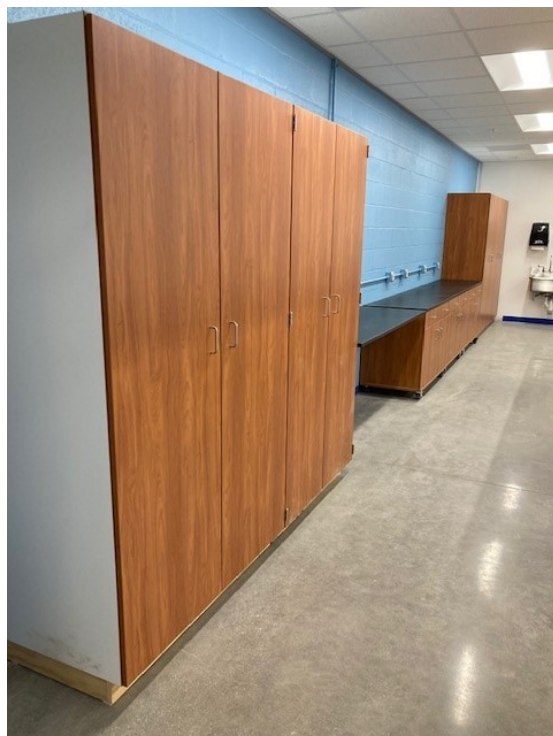
Week 46 – Casework for Art Room 307 Addition