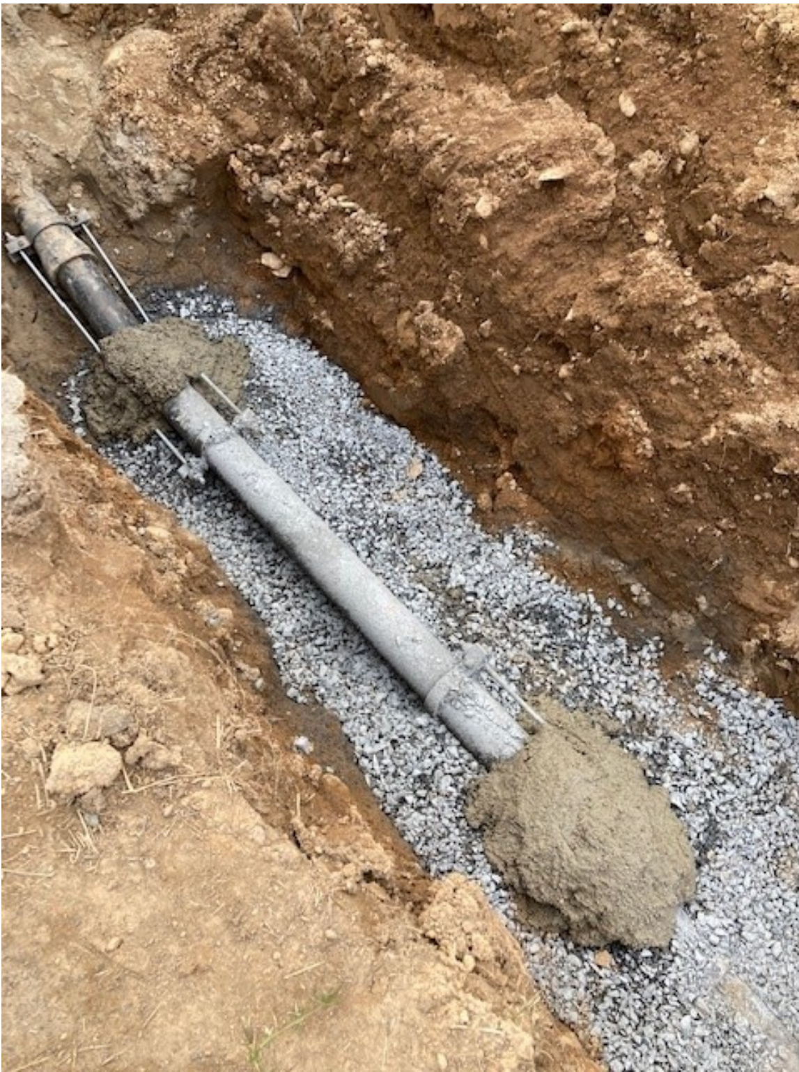
Week 46 – Fire Hydrant piping