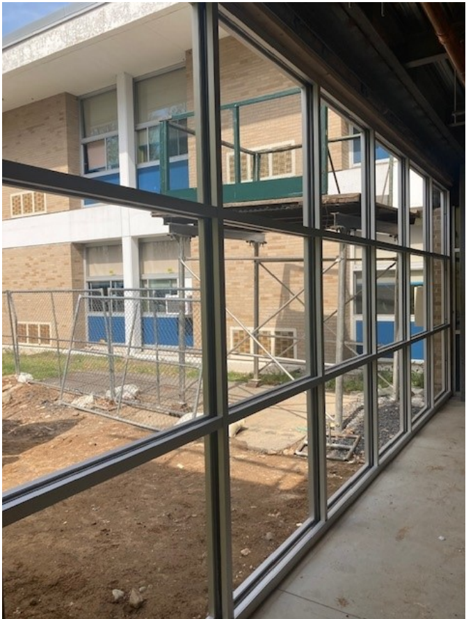
Week 48 – Installation of glass storefront for Music Wing