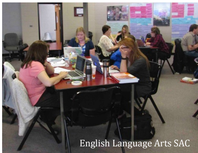
English Language Arts SAC

SAC members identified what is currently being taught and constructed topic cards and