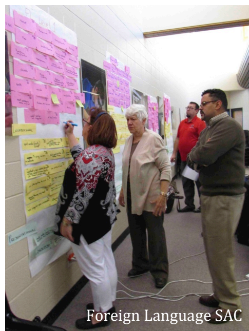
Foreign Language SAC

For more information on meetings and activities contact one a SAC member or visit the district Subject Area Committee webpage.