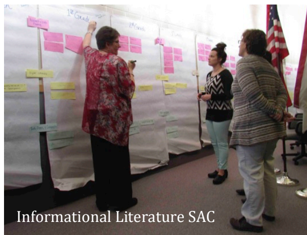
Informational Literature SAC

English Language Arts, Foreign Language and Informational Literature Subject Area Committees started meeting this year. They followed the same process as the Math and PE/Health SACs in that members surveyed teachers through questionnaires to learn exactly what is and is not taught in each class, grade level, and school. The Subject Area Committees made decisions about alignment and appropriateness of skills at each grade level.