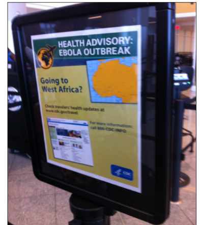
Health advisory for airline travelers