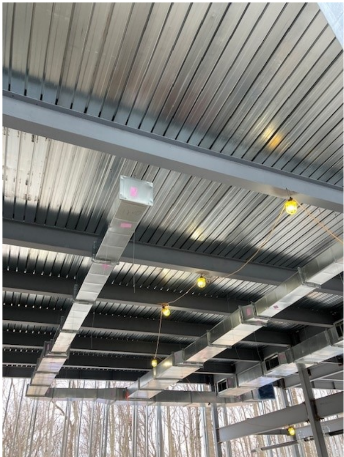
Week 43 – Ductwork for the Music Wing addition