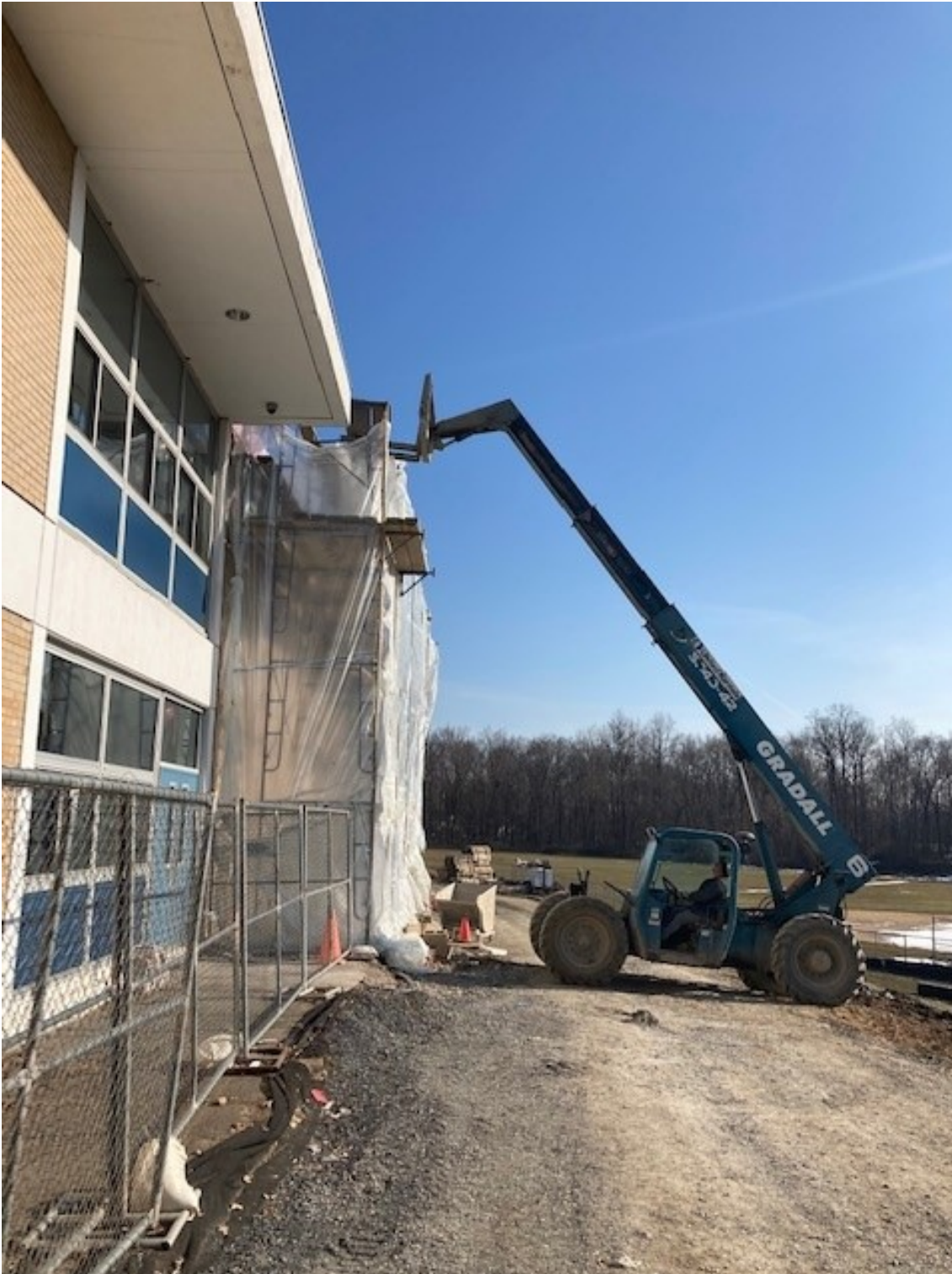
Week 42 – Getting closer to topping out with the masonry for the Gymnasium addition