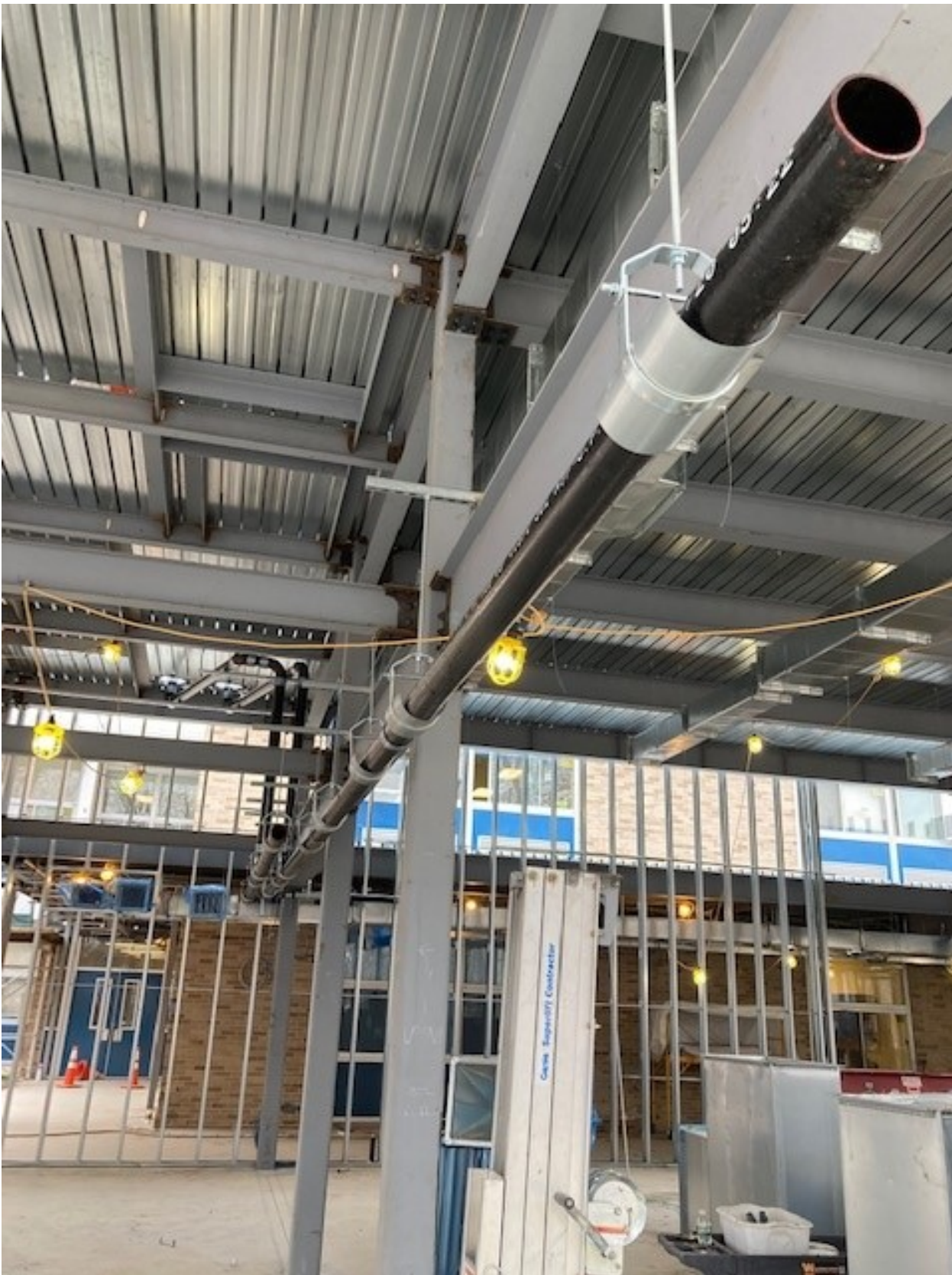
Week 43 – Roof drain piping in the Music Wing