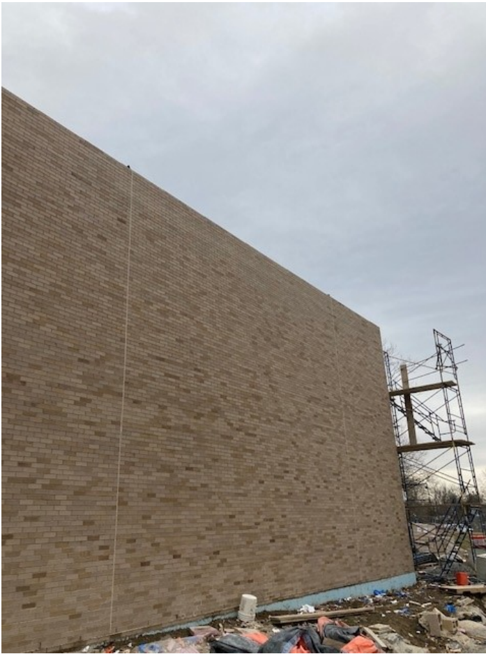
Week 43 – Brick applied to the backside of the blocks for the Gym addition exterior