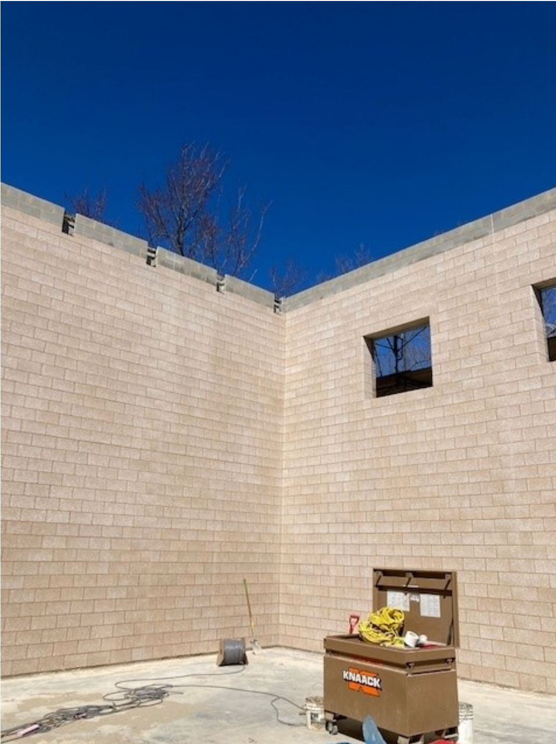
Week 43 – Block work completed for the interior of the Gymnasium addition

1 Week Update – Week 43 (March 15 thru March 19, 2021)