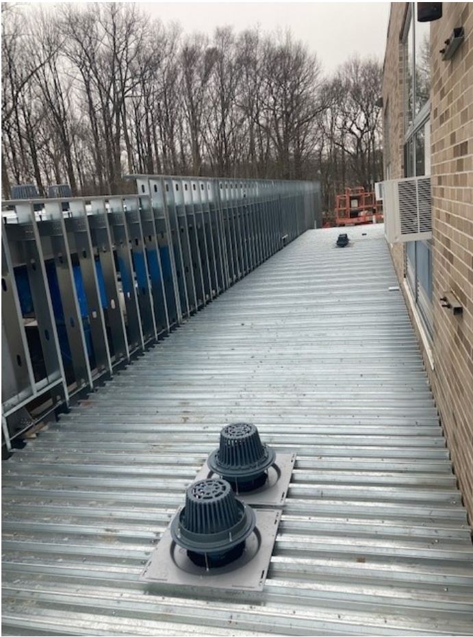
Week 43 – Metal deck and roof drains for the Music Wing addition