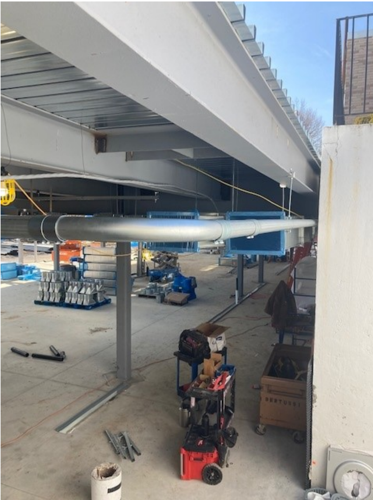
Week 42 – Mounting electrical conduit that will bring power into the Music Wing addition