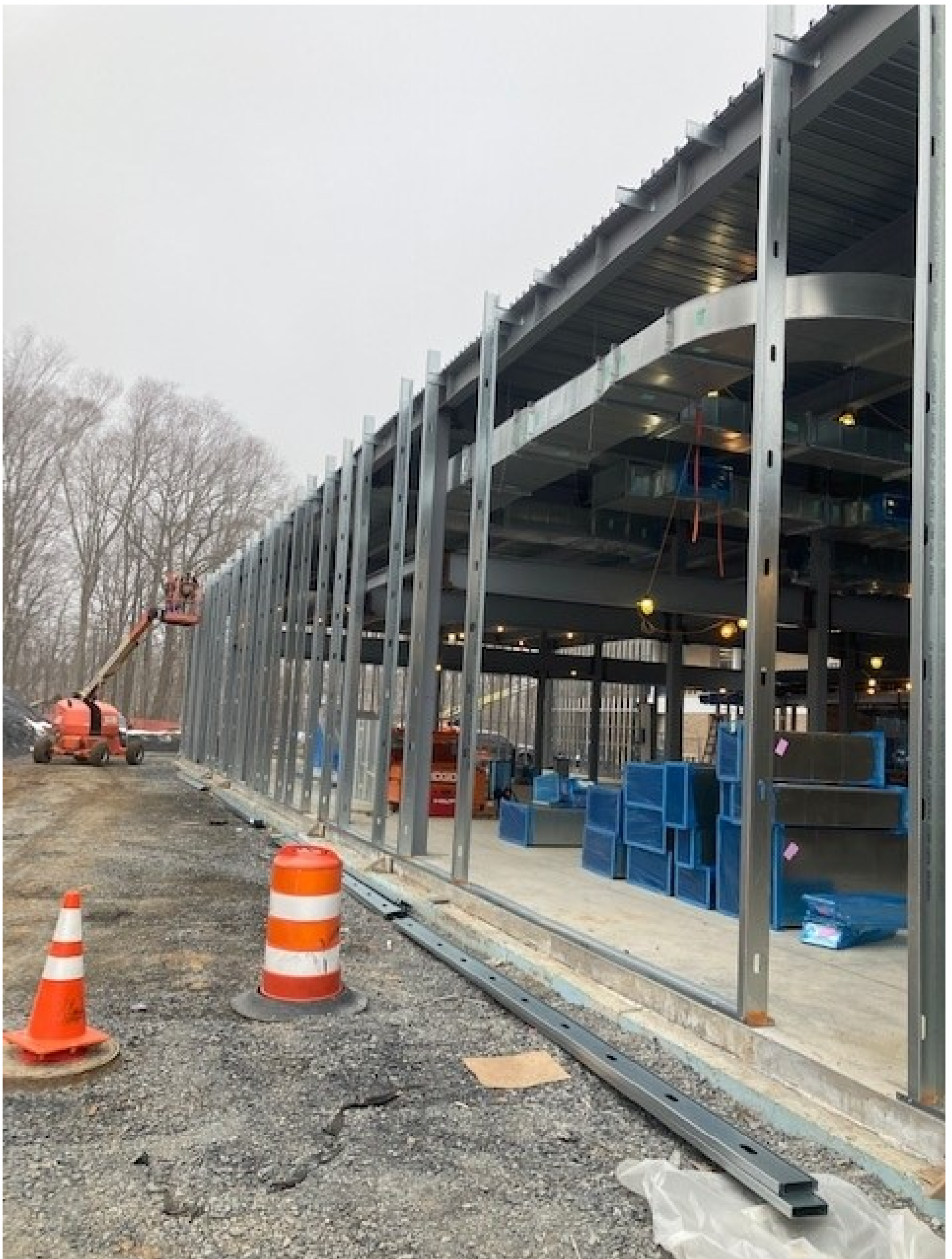
Week 42 –Beginning to install metal stud framing for the Music Wing addition