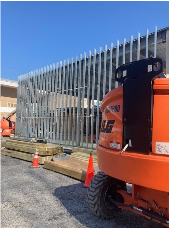
Week 42 –Portion of metal stud framing completed for the Music Wing addition