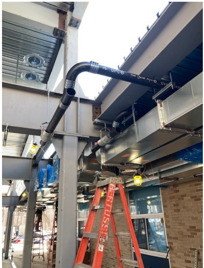
Week 42 – Hanging the black piping for roof drains along with ductwork and electrical conduits