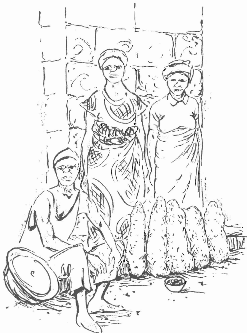
A man and his wives receive a gift of yams from their daughter's husband