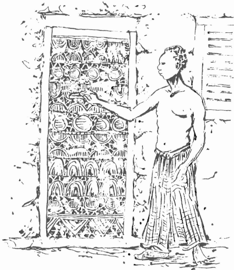
The beautifully carved door of a senior man