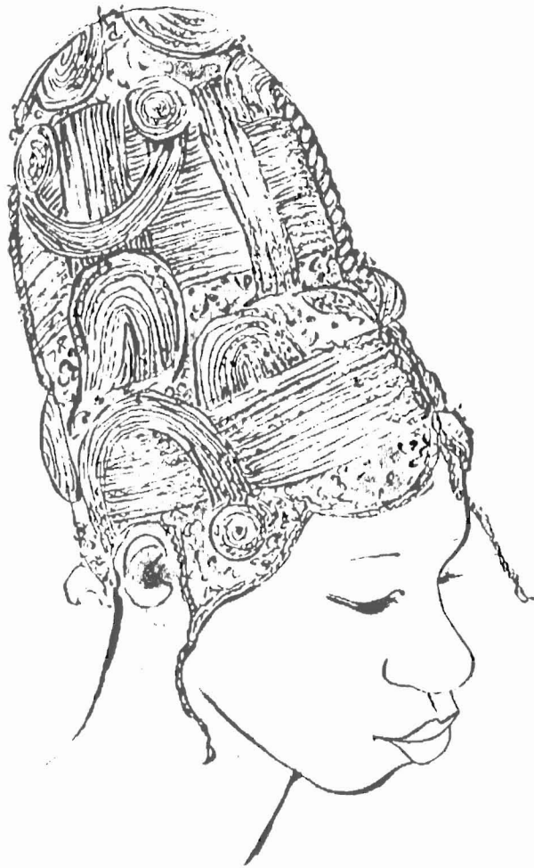
An elaborate coiffure for a girl whose marriage is being negotiated