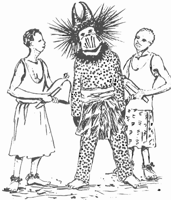
A masked figure, representing an ancestral spirit