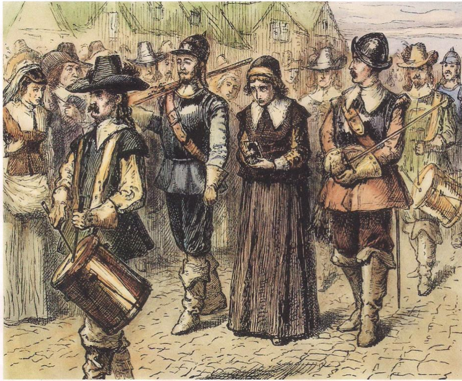
Artist's drawing of exile of Anne Hutchinson