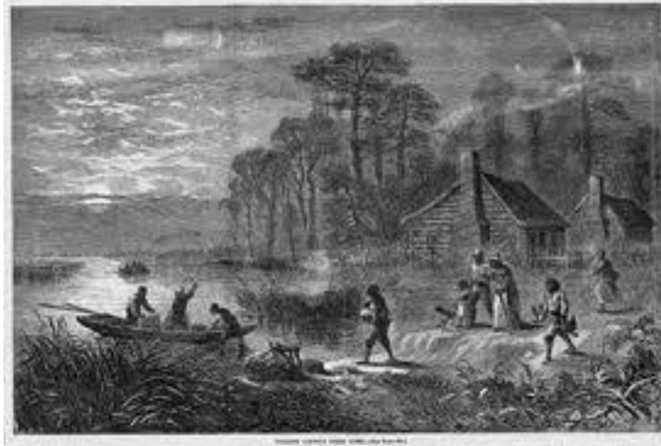
Artist's drawing of escaped slaves traveling by night.