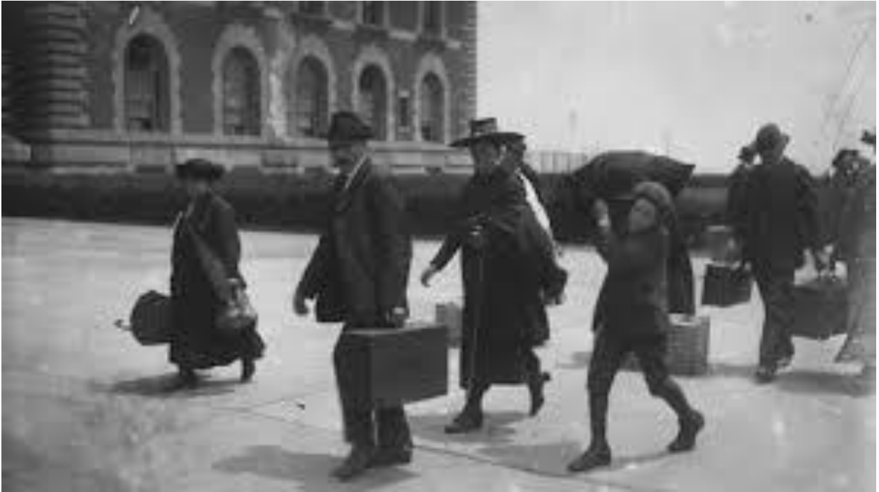
Early 20 th century immigrants arrive at Ellis Island, New York City