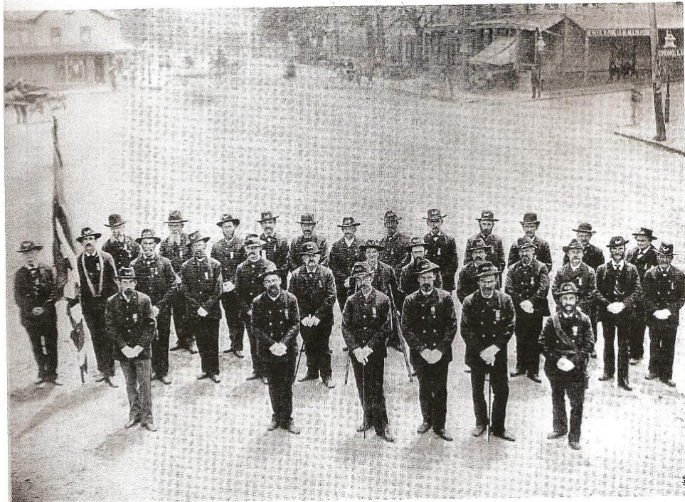
Historic photo of Rye Town's Company B — first to answer call to Civil War

Wait! Stop! (Looks after them with head bowed.)