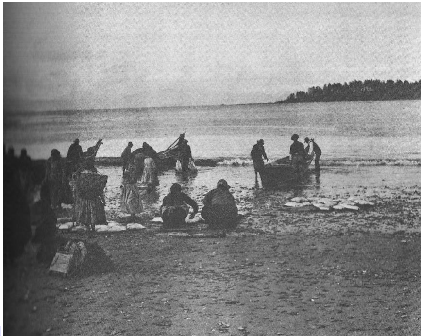
Rye Beach shoreline from Internet file.

Poninga: Wait! I want to hear the white man's words. (Drums lead into RAP / Native American style rhythms)