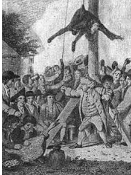
Artist's drawing of a Tory being "punished" by his neighbors.