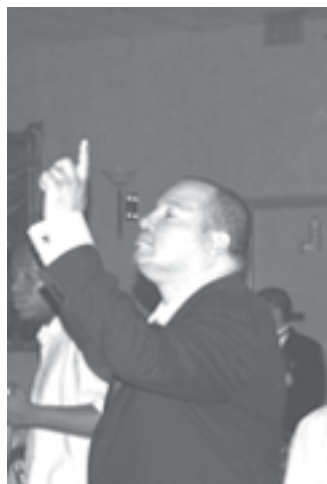
Superman at his best