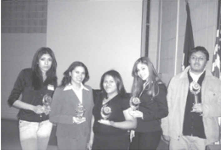
Students show off their awards after competiton.