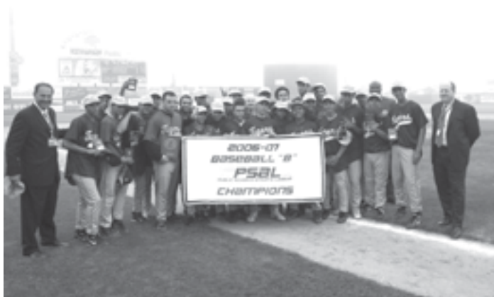
Tigers become QV's first city-wide champions.