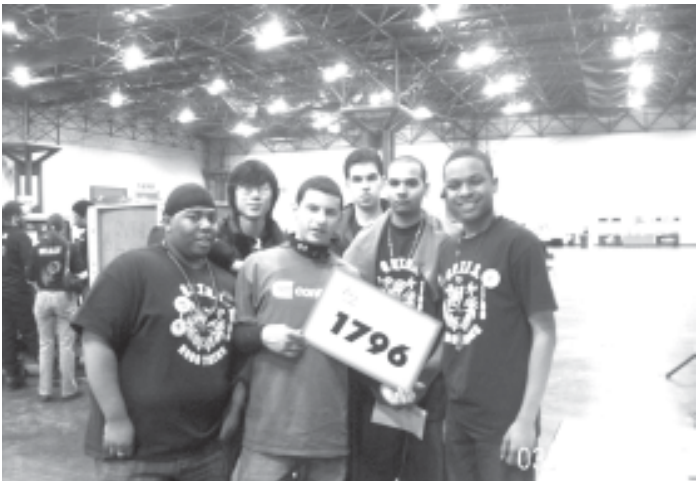
Robot designers after a hard day at work.