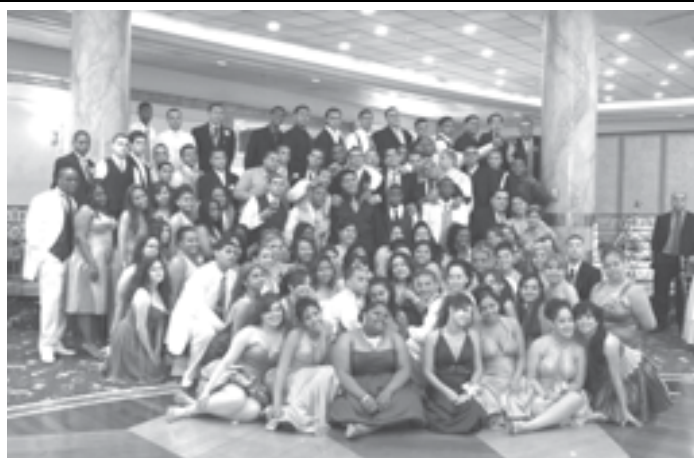
Seniors celebrate at Terrace on the Park.