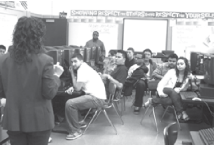
Listening to pros helps students learn about life.