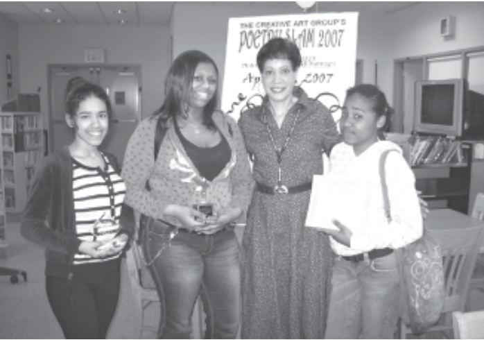
Smiles show slam's success.