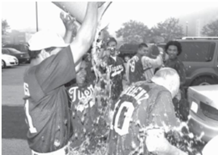
Coach gets a gatorade shower.

On Tuesday, June 5, Queens Voc had its sports banquet. So did fourth-seeded Taft HS. But both teams had other plans. They played the semi-finals, the