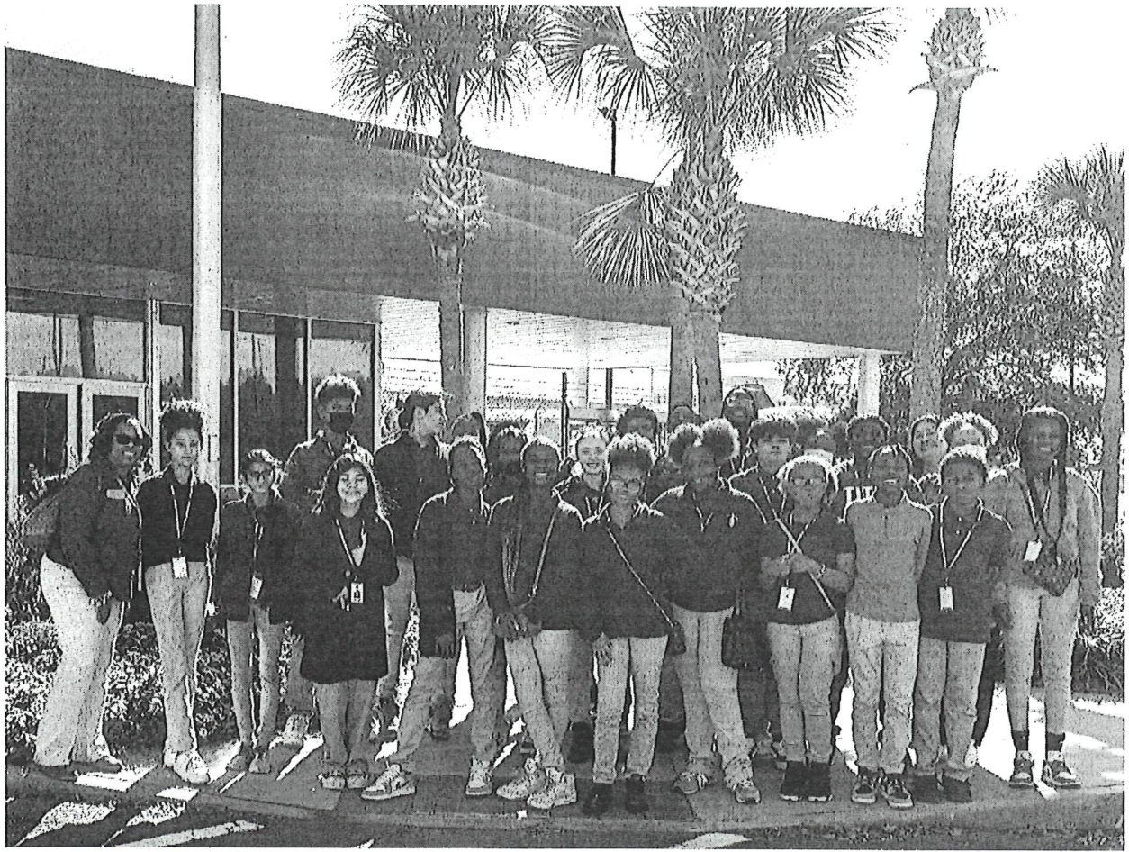
Orchestra students at the food court after Savannah Philharmonic field trip at the Lucas Theatre.