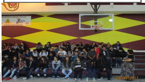
The 8th graders were excited to start a new school year!!