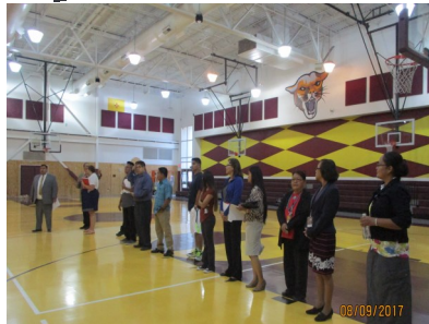
Teachers welcomed students and introduced themselves.