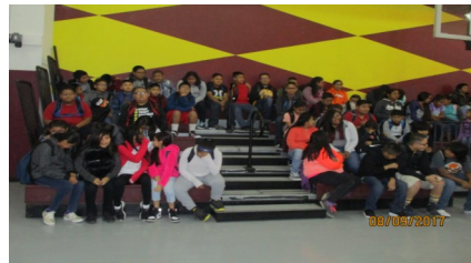
The newest middle-schoolers, the 6th graders, were intently listening.