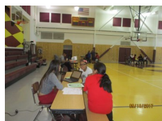
TOM held a Parent – Teacher's conference on September 18, 2017 at the gym.