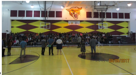
First day of school: August 9, 2017: Students were ushered to the gym for a welcoming program.