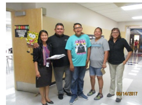
TOM had two Open Houses held on August 19, 2017 and September 12, 2017.

Thank you, parents, for visiting and collaborating with the teachers!