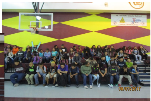
7th graders were happy to see their classmates and friends again.