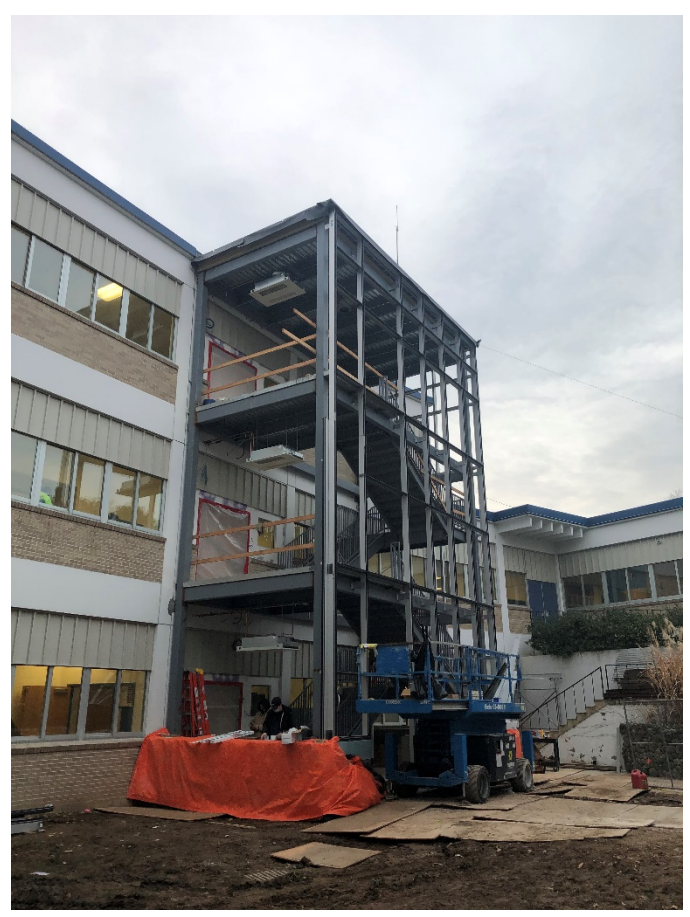
Week 34 – Mullions for curtainwall need to be installed on one side