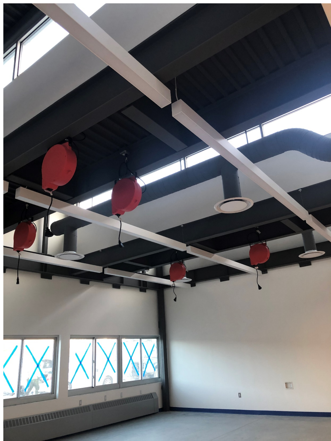
Week 33 – Interior of the Art Room addition