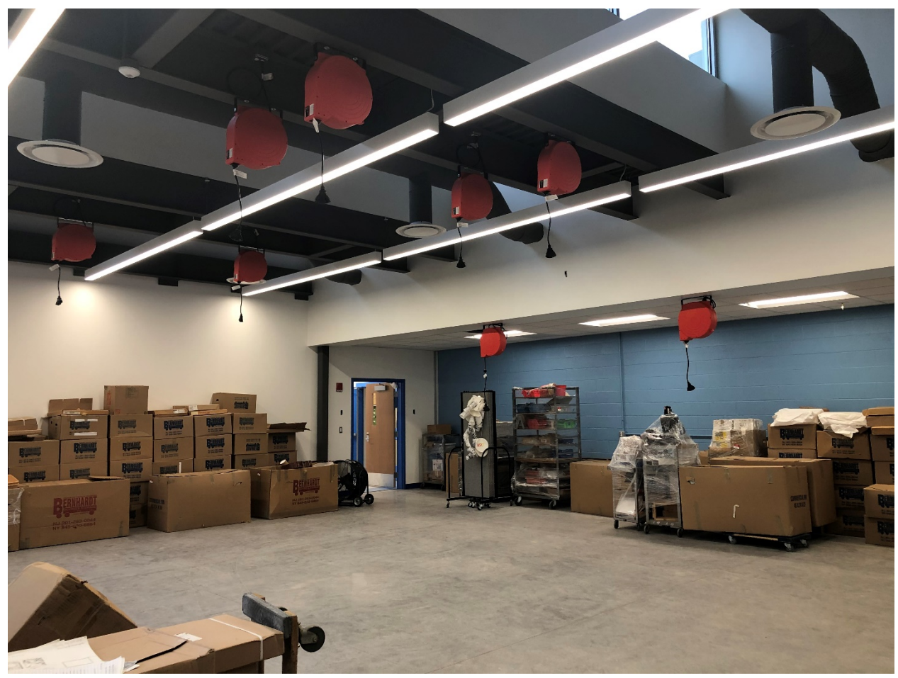
Week 34 – Interior of the main space turned over to the School for move-in