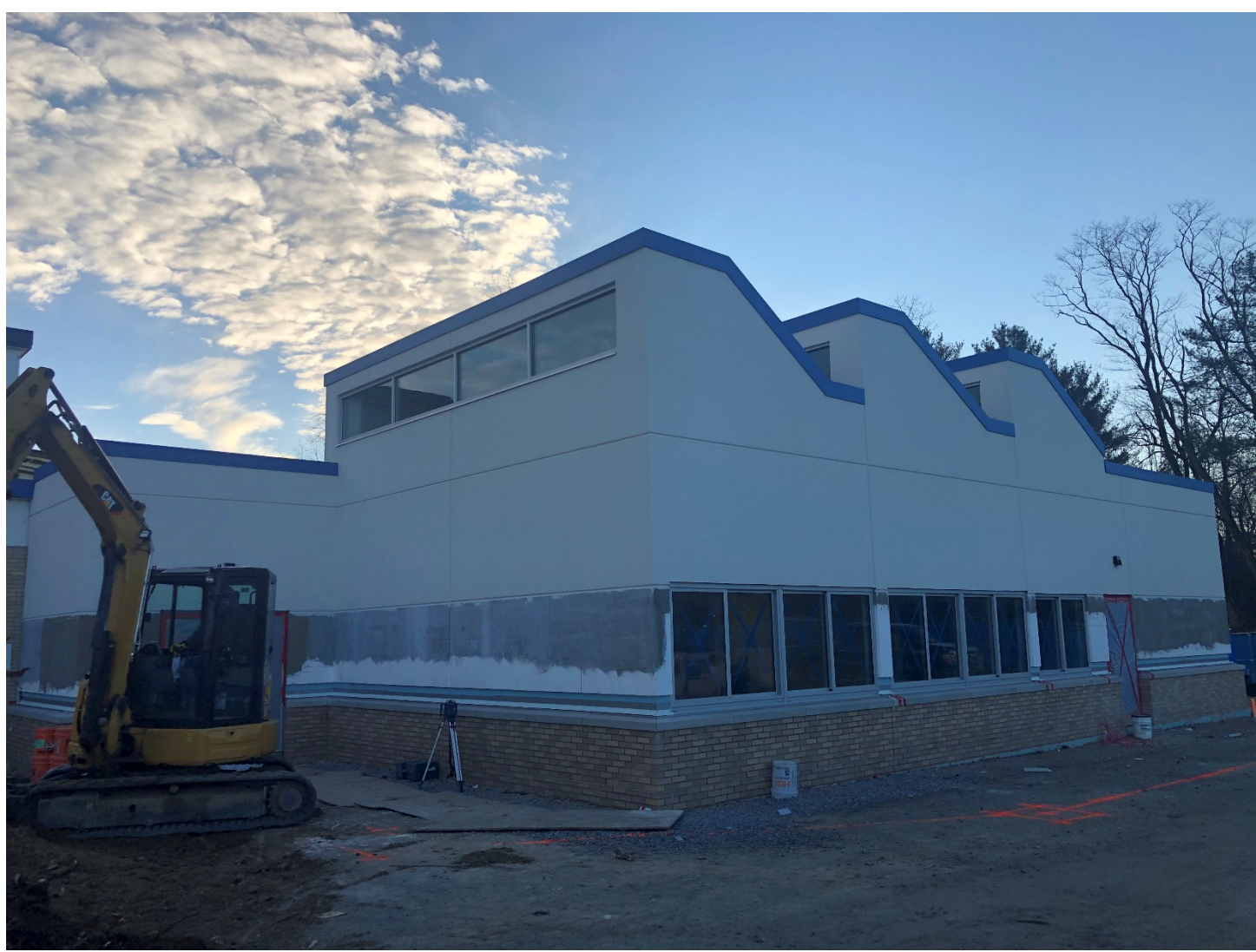
Week 33 – Edge flashing for roof for Art Room addition completed