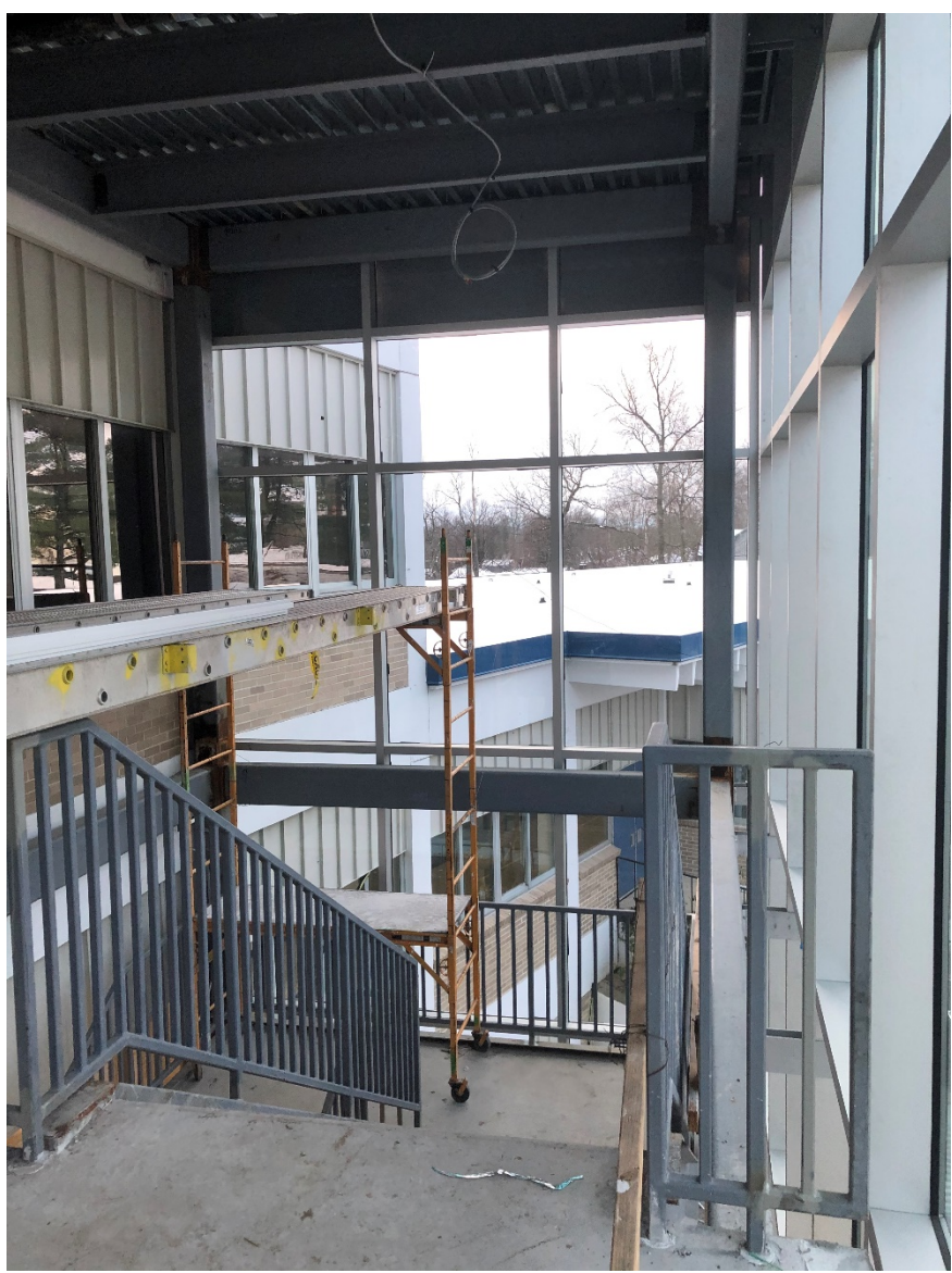
Week 36 – Interior of the Stair Tower, 3<sup>rd</sup> floor landing