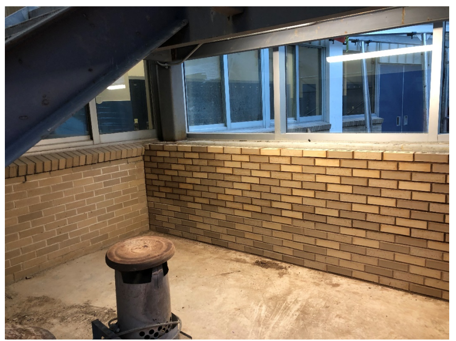
Week 36 – Interior brick finish to match the existing inside the Tower on the ground floor