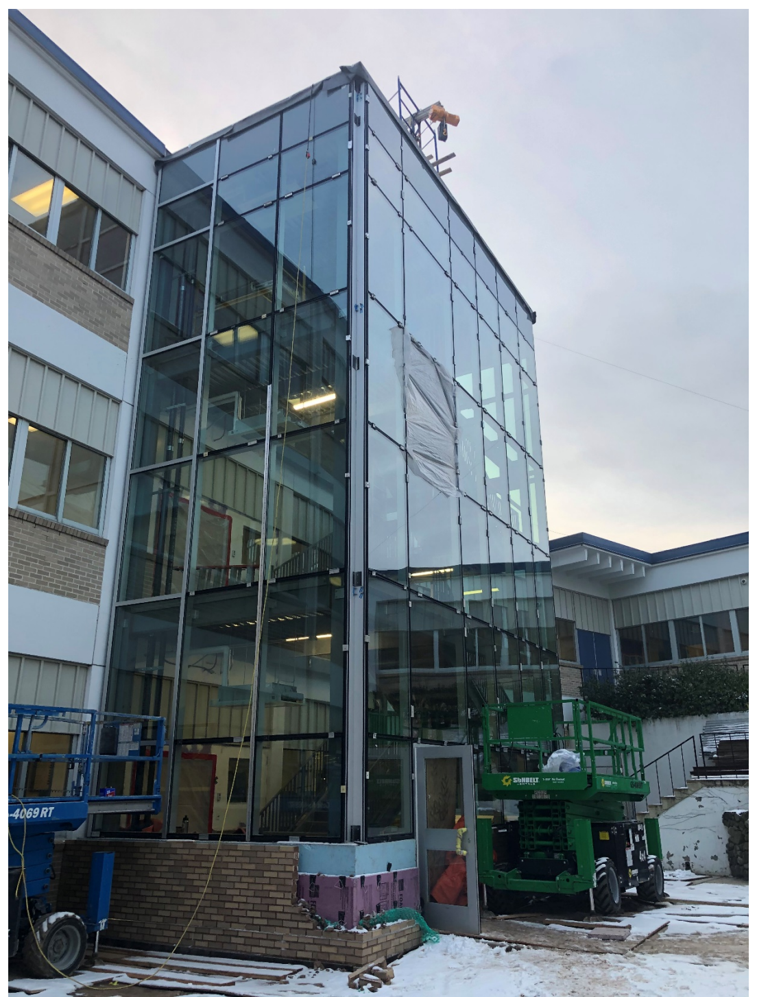
Week 36 – Glass installed on Stair Tower