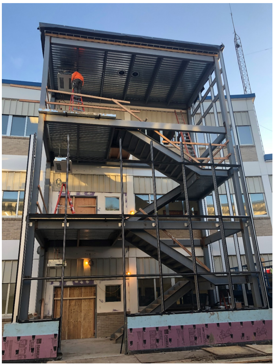
Week 33 – Mullions for glass curtainwall system being installed