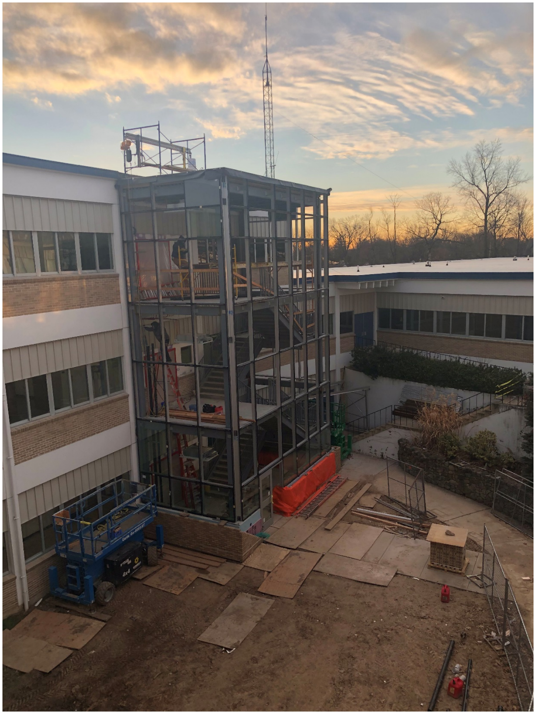
Week 35 – Beginning to install glass panels on Stair Tower