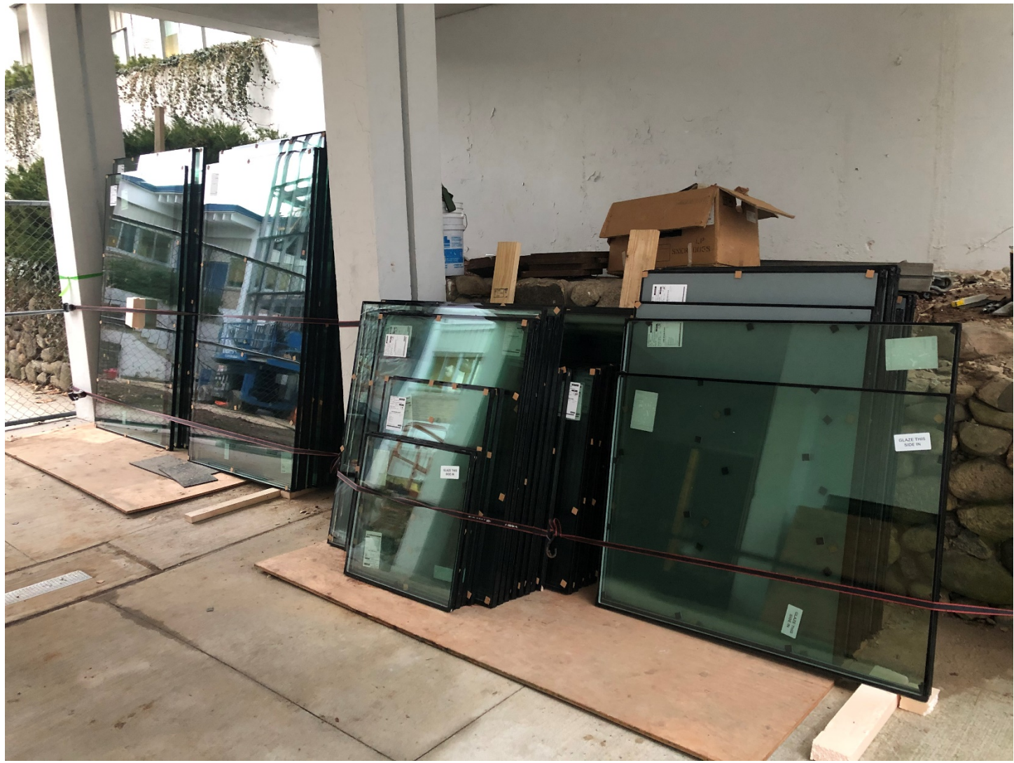
Week 34 – Glass units on site & ready to be installed for Stair Tower