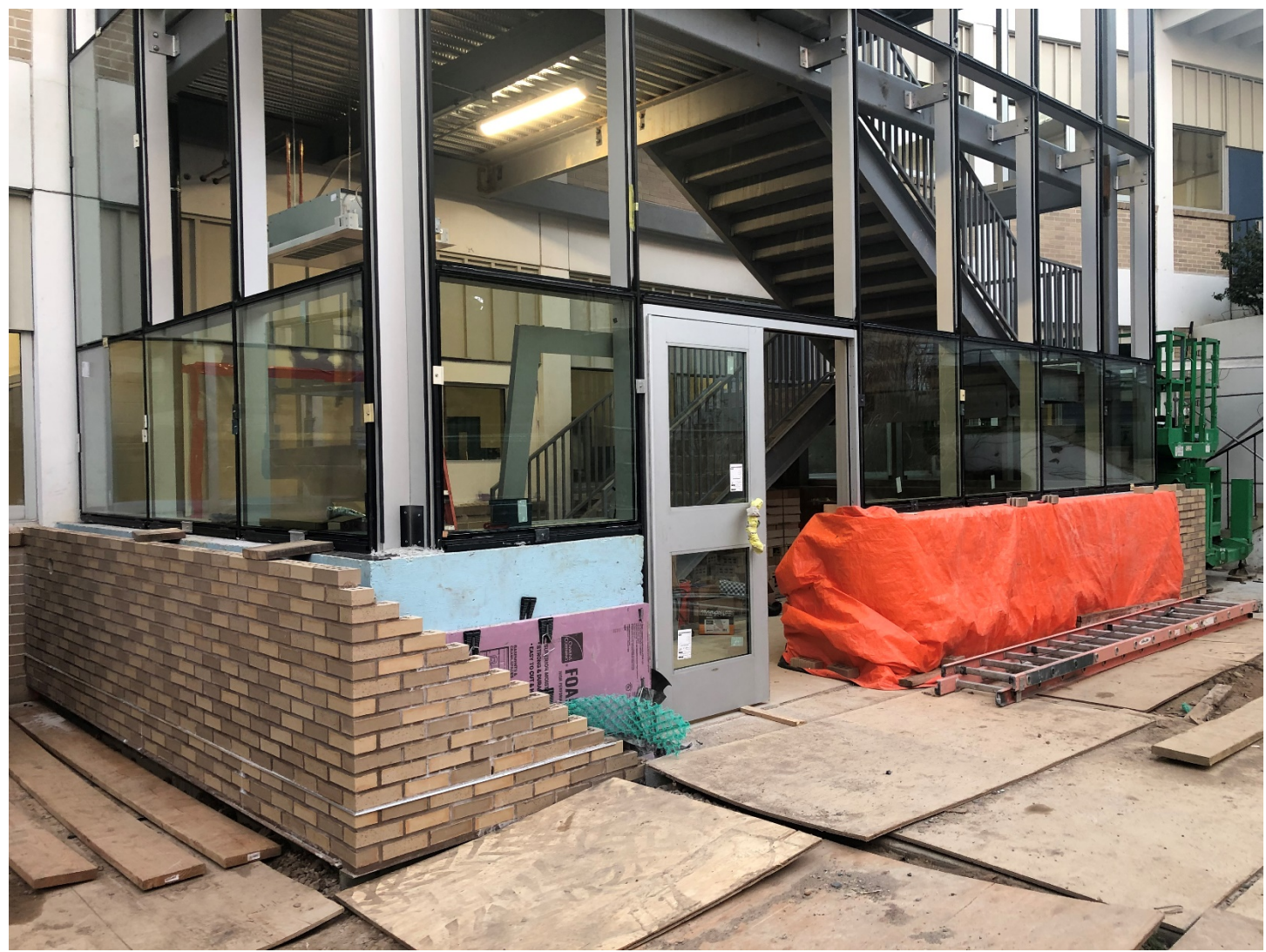
Week 35 – Progress of work for brick base & glass panel installation for Stair Tower