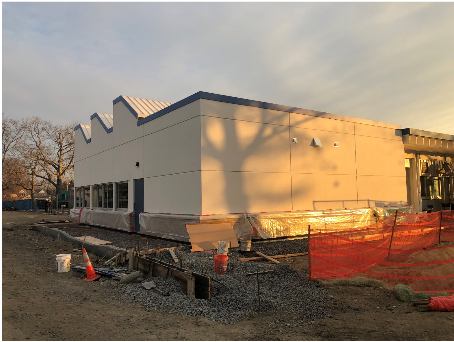
Week 35 – Art Room addition completed, preparing to pour concrete sidewalks