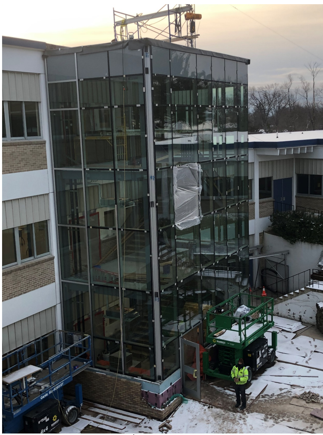
Week 36 – Stair Tower from the 3<sup>rd</sup> floor Corridor inside the School