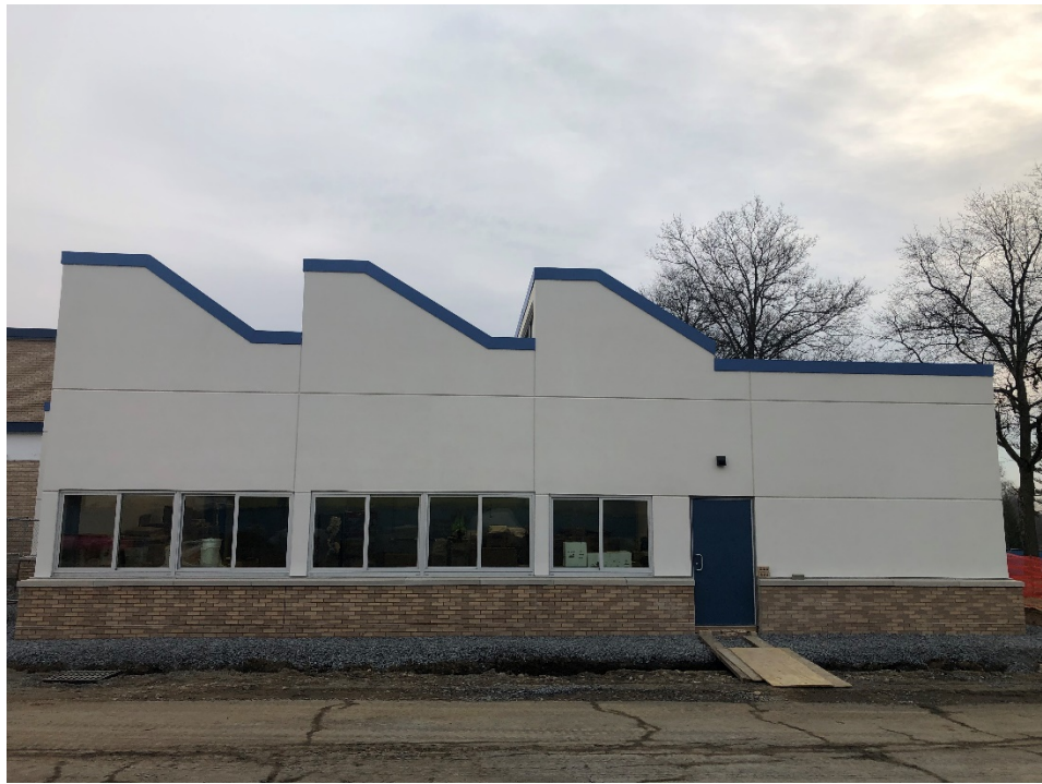
Week 34 - Due west elevation of the Art Room addition