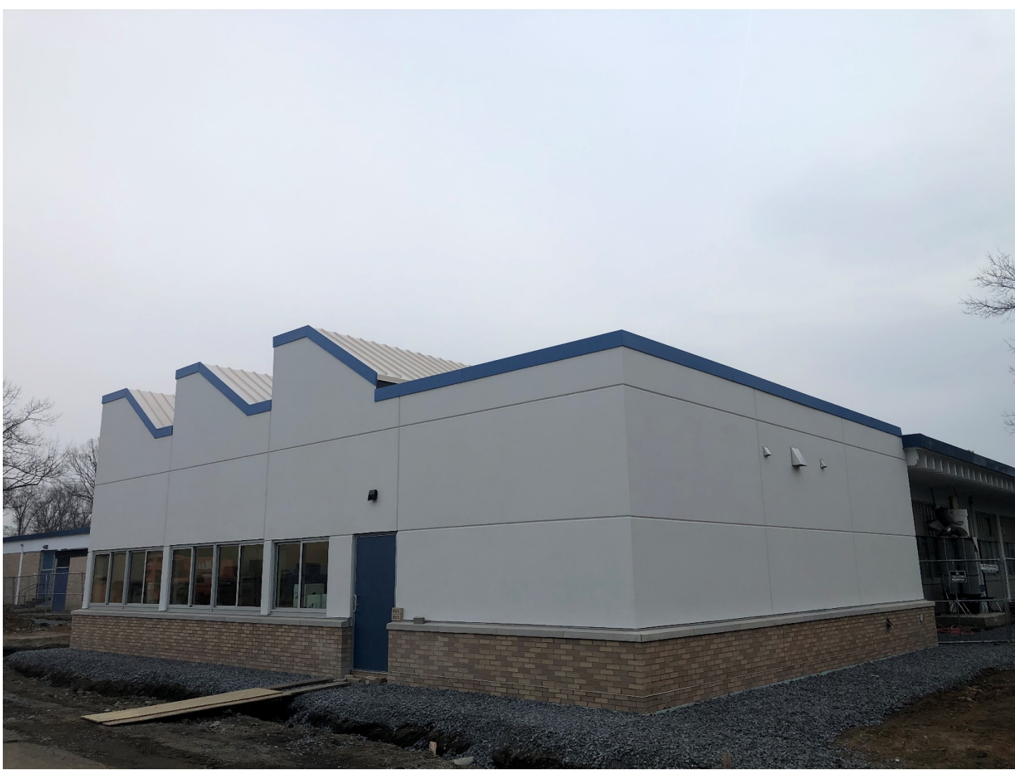
Week 34 – Art Room addition