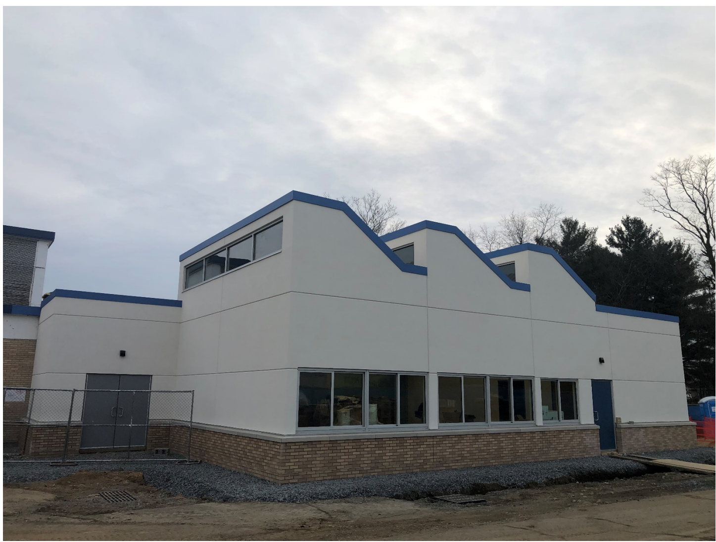
Week 34 – Art Room addition completed, site work pending