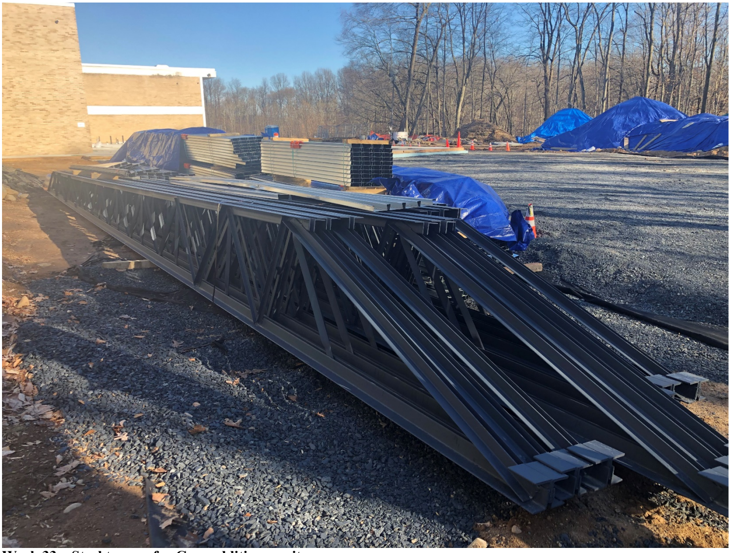
Week 33 – Steel trusses for Gym addition on site