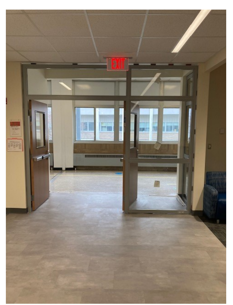
Week 29 – Storefront entrance for Library installed