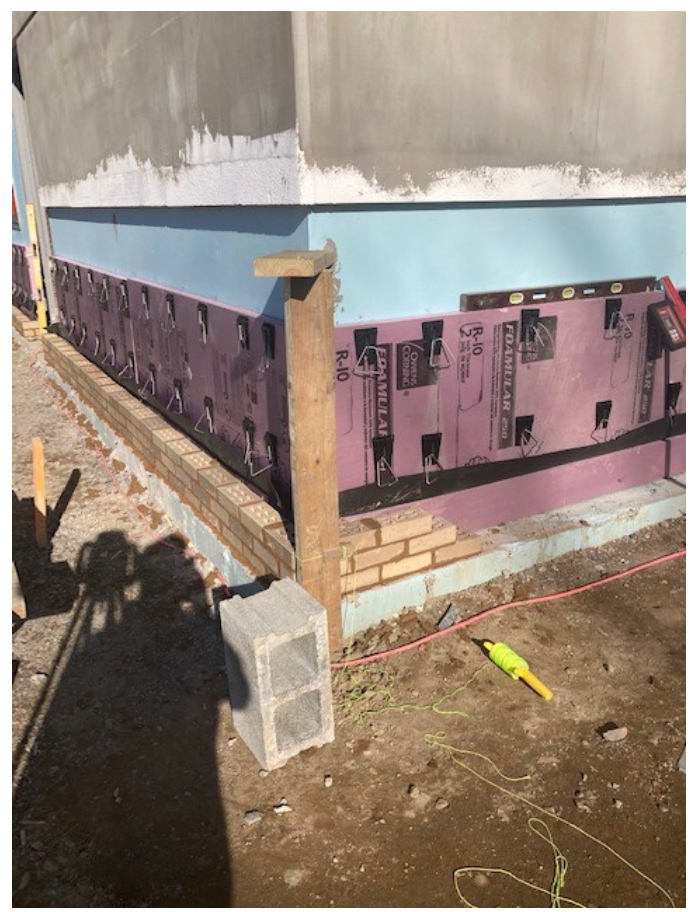
Week 28 – Brickwork started