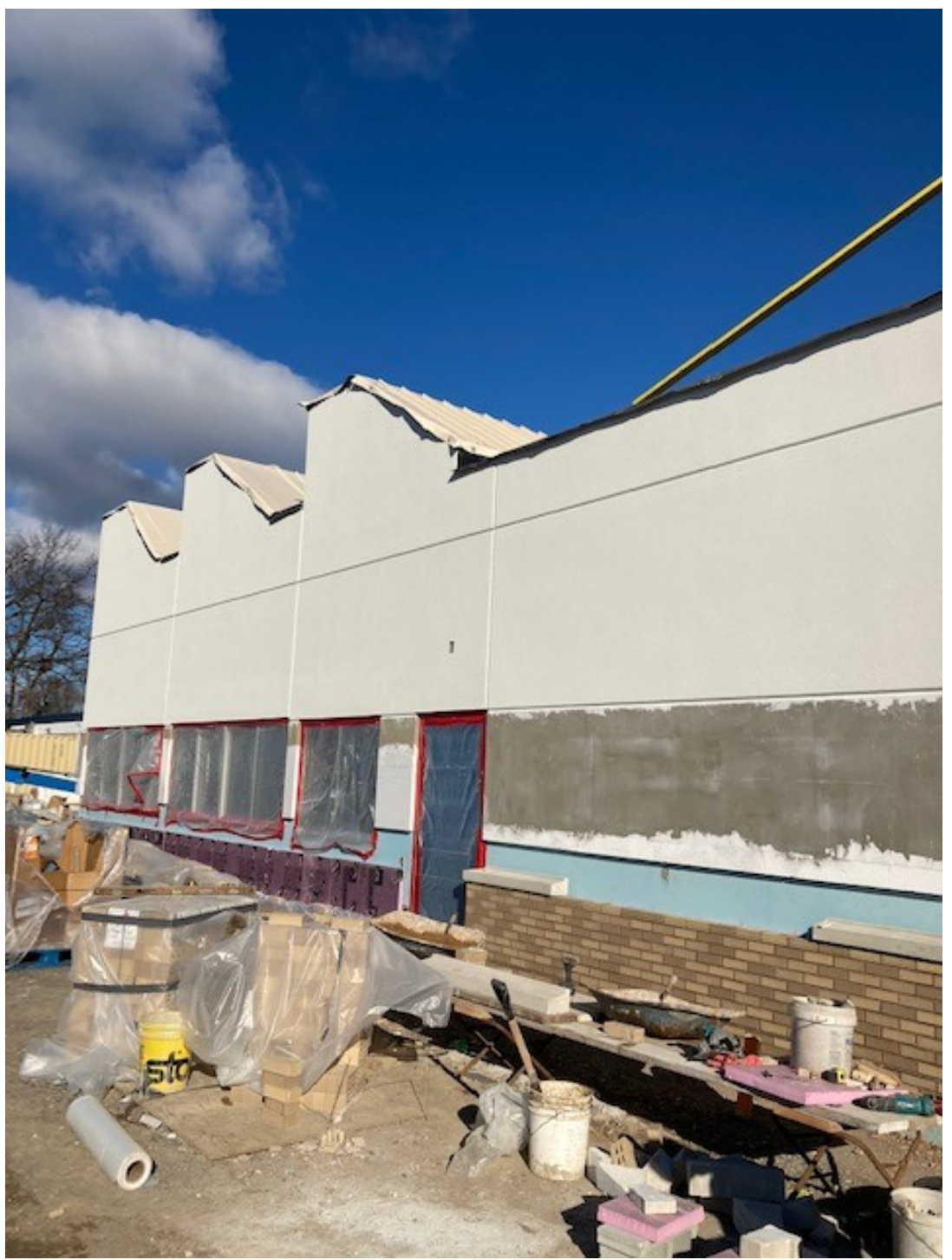
Week 29 – Brick work in progress with partial install of capstone trim for transition to EFIS