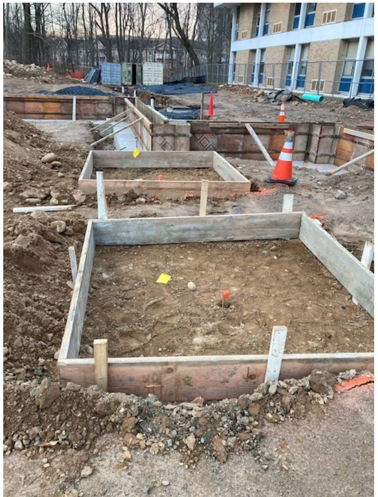
Week 28 – Concrete footings for Music Wing addition are completed, formwork going in for foundation walls & column footings