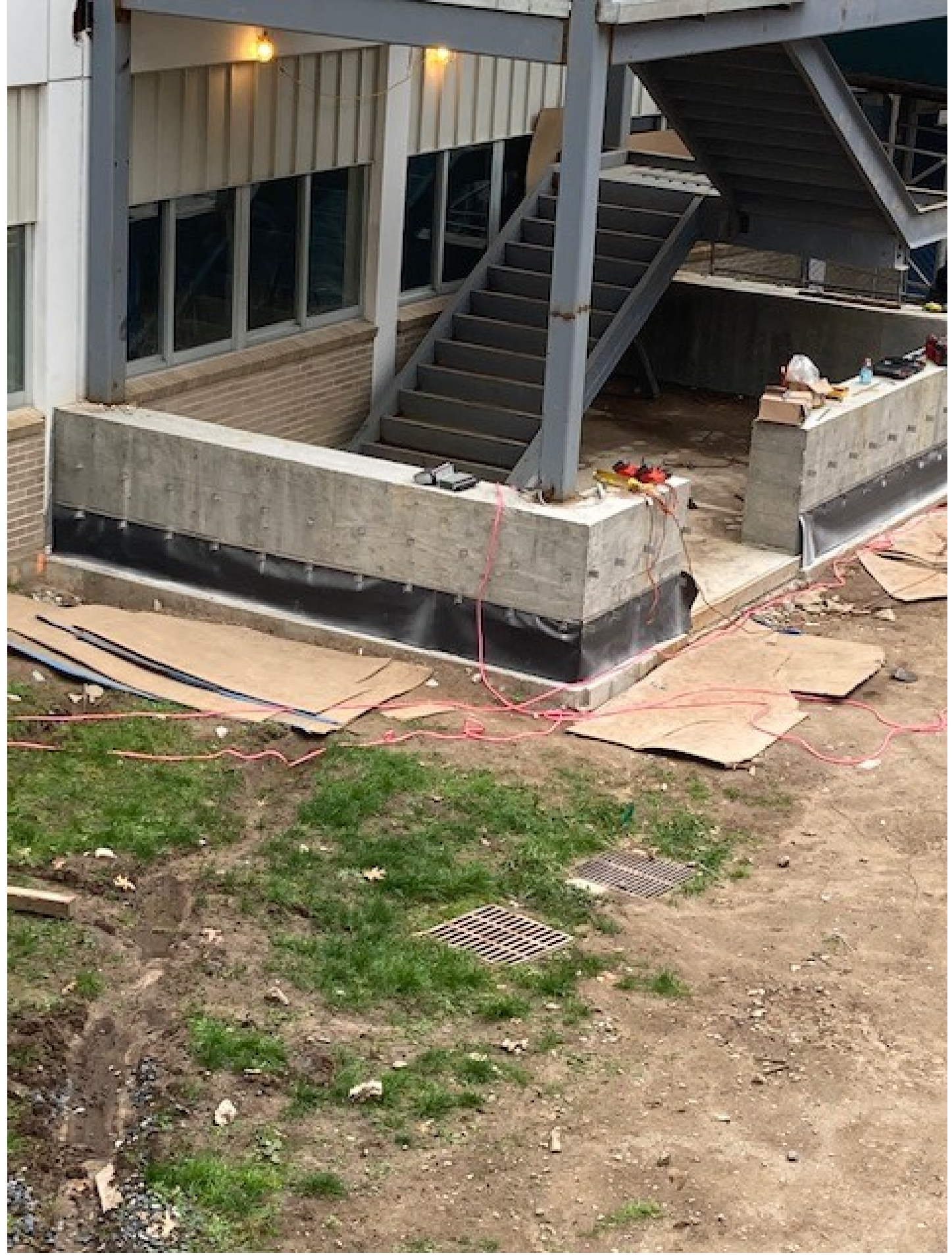
Week 29 – Beginning to prepare for the installation of the brick base for the Stair Tower