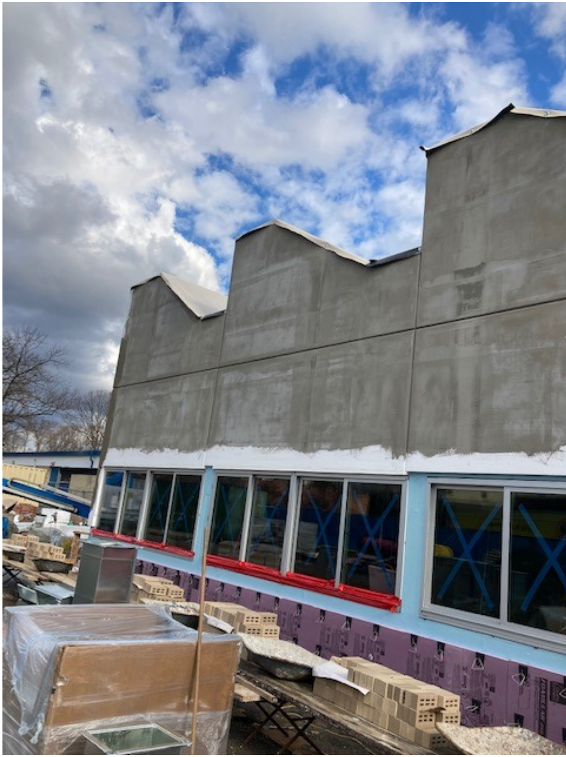
Week 28 – Windows installed & EFIS cladding in progress for Art Room addition