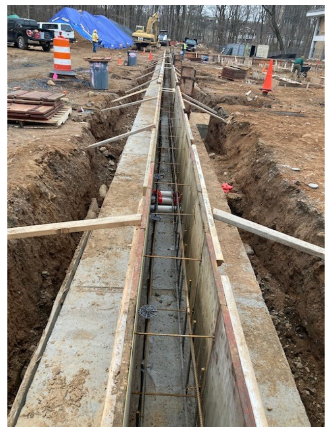
Week 29 – Rebar & formwork in place for pouring of the concrete foundation walls for the Music Wing at the beginning of the week