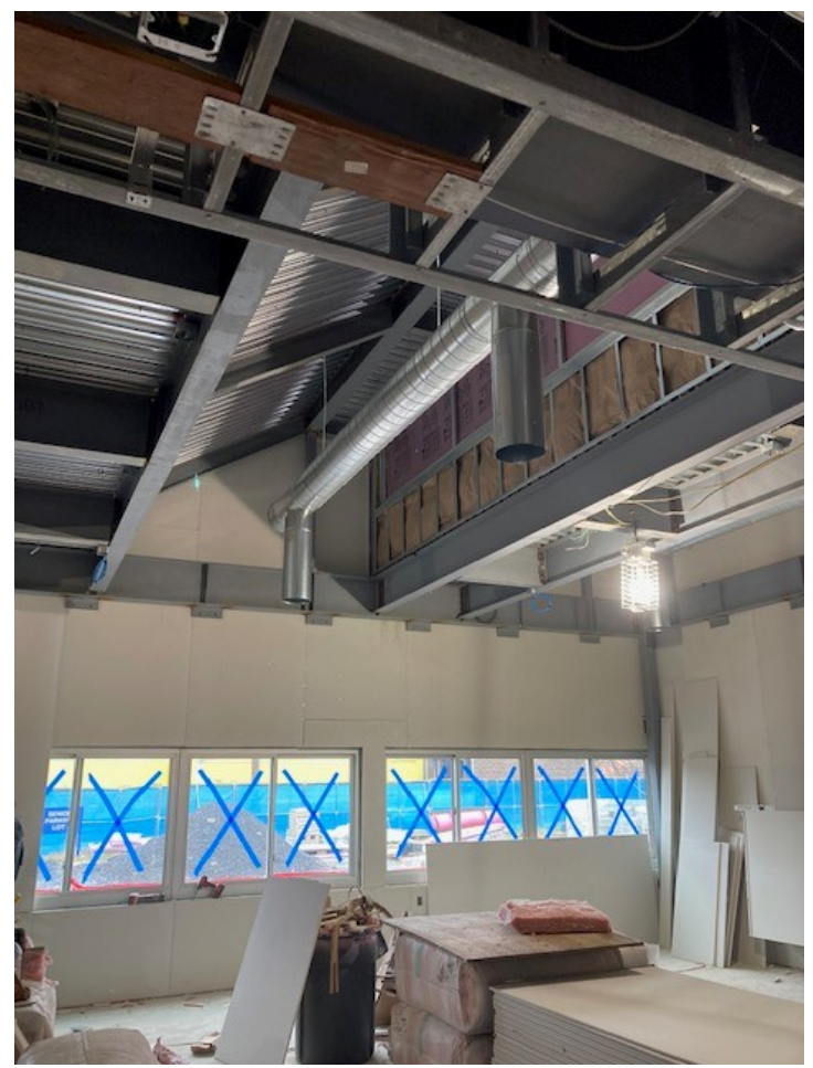
Week 29 – Gypsum Wall Board installation along with exposed steel structure & ductwork