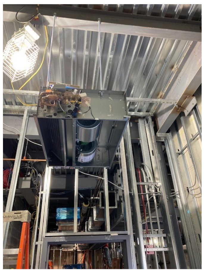
Week 28 – Framing of interior partitions is complete; Mechanical ductwork & equipment being installed; Electrical roughing finished