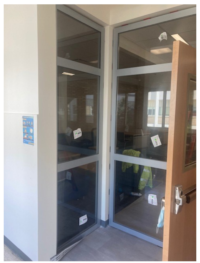
Week 28 – Storefront entrance for Library installed