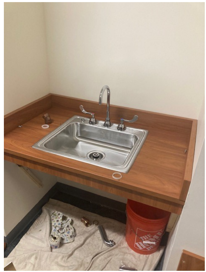
Week 28 – Sinks in Music Wing Rooms installed