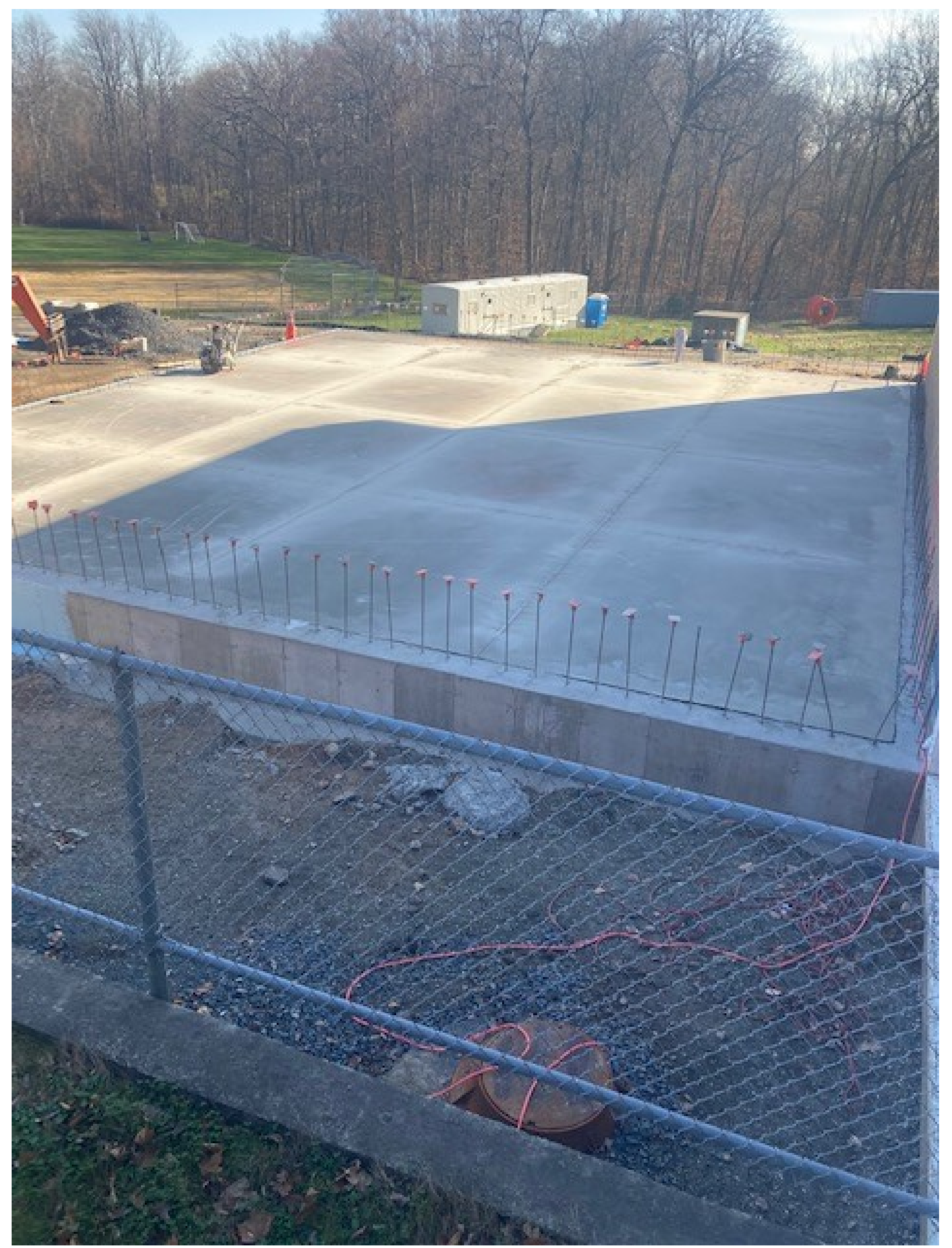
Week 28 – Concrete slab for Gym addition poured