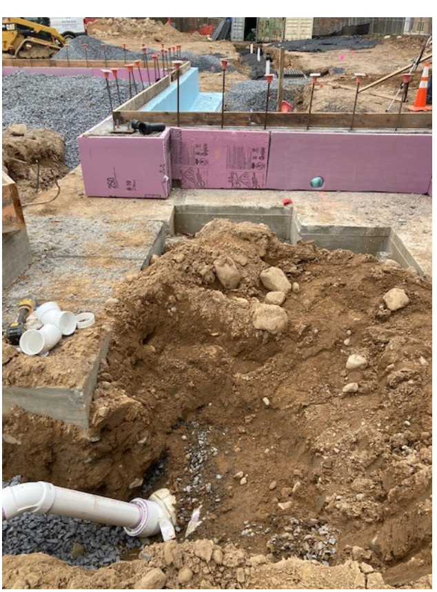
Week 29 – Foundation walls at Music Wing are completed with rigid insulation applied to the inner side & moisture barrier on the exterior and doing underground plumbing work mid-week