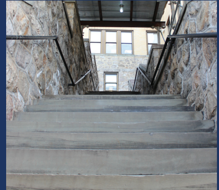
Portables and Security