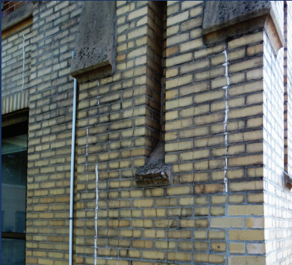
Basement level classrooms