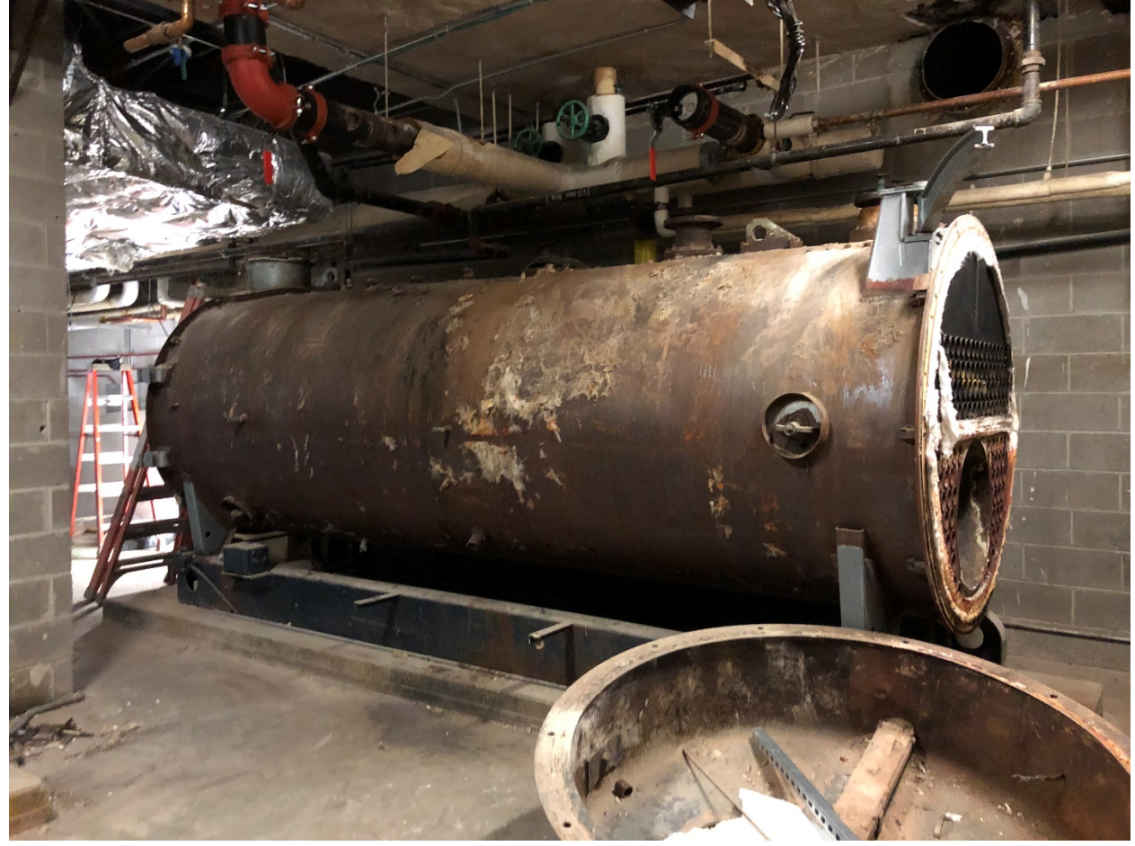
Week 20 – Old boiler in the process of being dismantled for removal