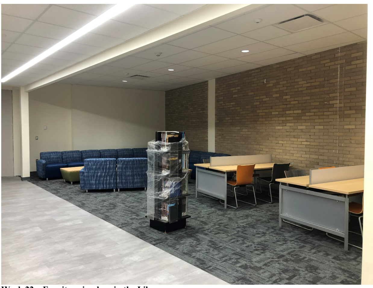
Week 22 – Furniture in place in the Library