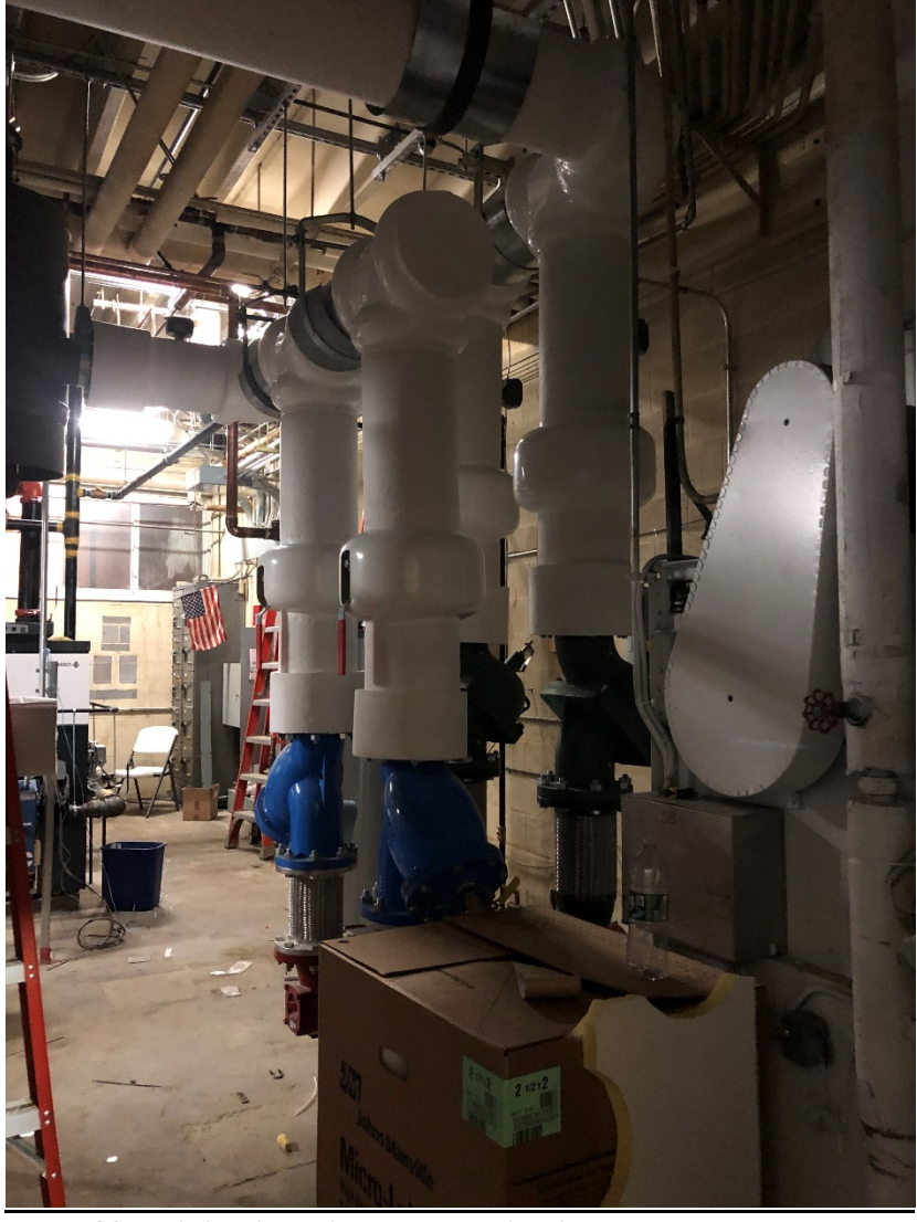
Week 22 – Piping in Boiler Room being insulated