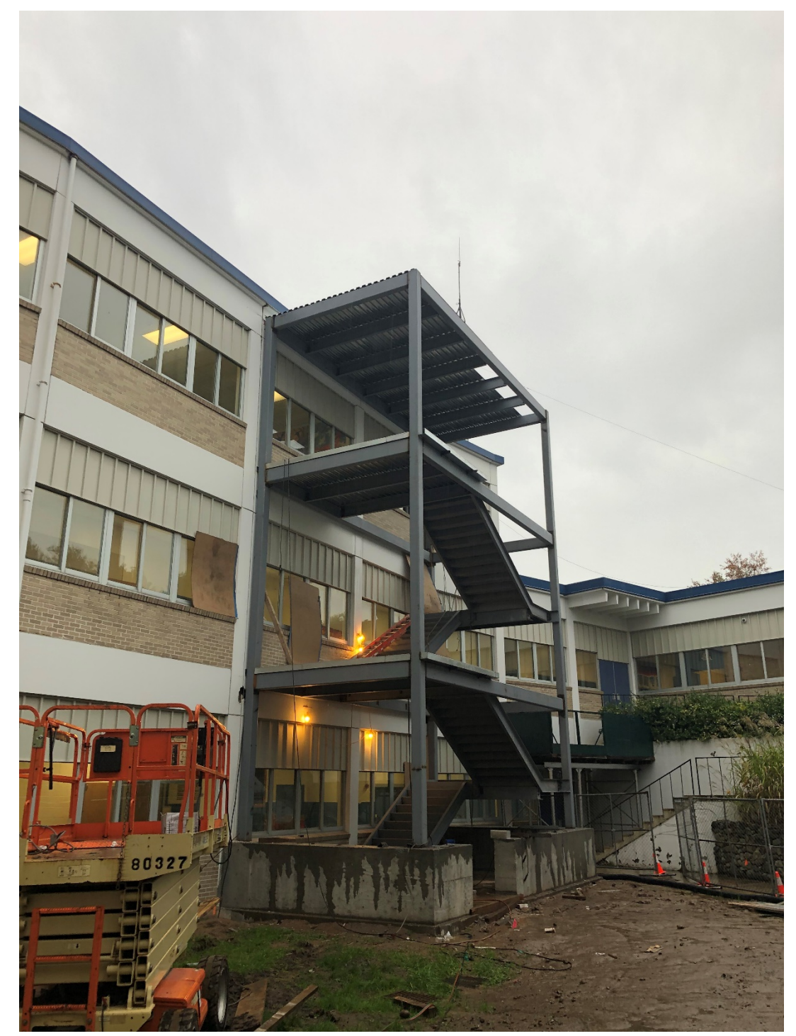
Week 23 – Progress of the work for the Stair Tower