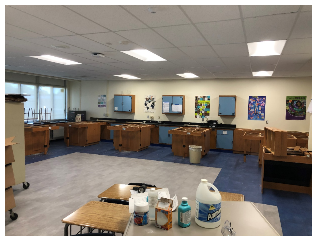
Week 21 – Installation of the casework in the Science Wing Classrooms

Weekly Updates – Week 21 (October 12 thru October 16, 2020)