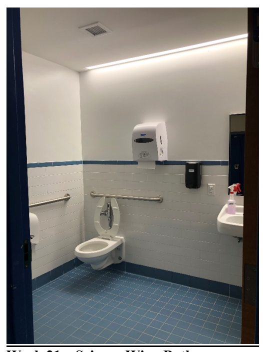
Week 21 – Science Wing Bathroom completed