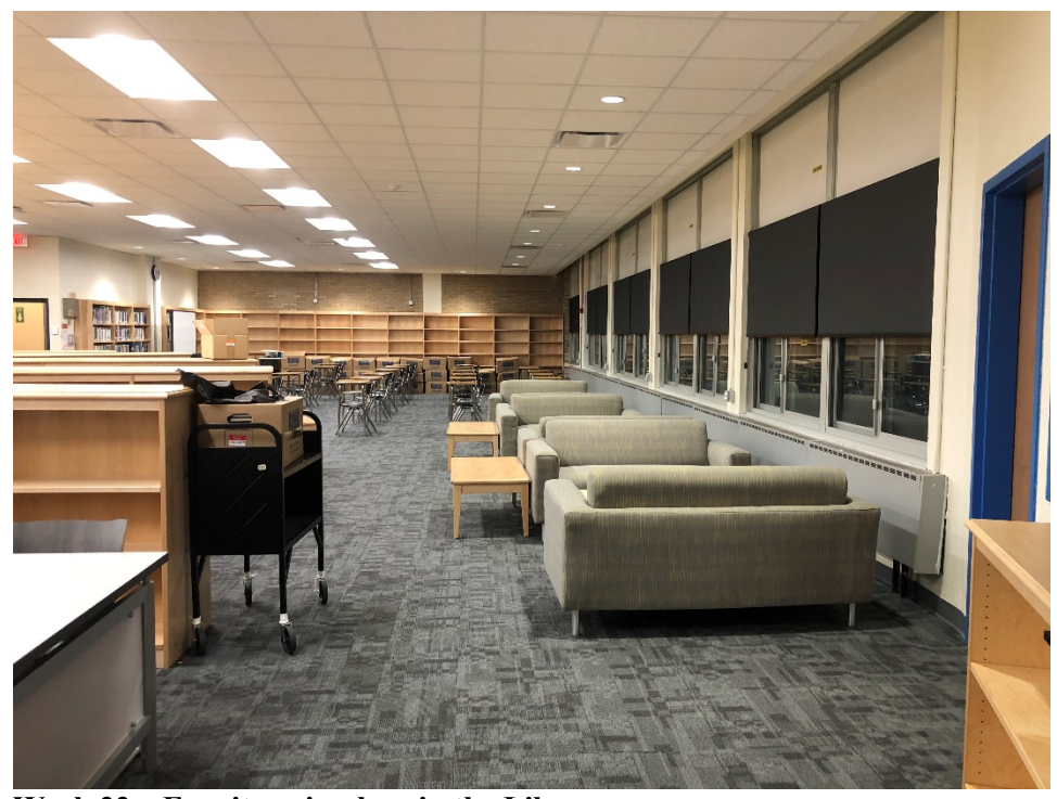
Week 22 – Furniture in place in the Library