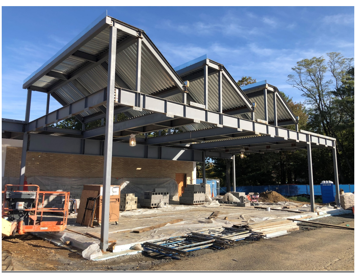
Week 21 – Metal deck installed on roof, wood blocking for roofing started and CMU block wall along the existing building has begun