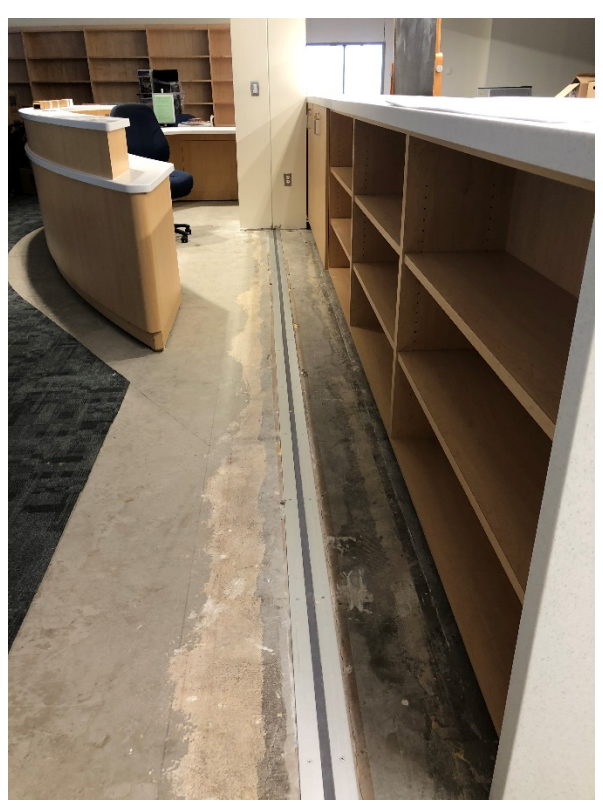
Week 20 – Installation of the expansion joint assembly completed in the Library

Weekly Updates – Week 20 (October 5 thru October 9, 2020)