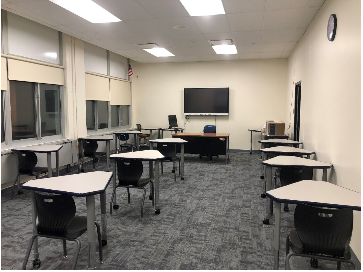
Week 22 – Furniture in place in Mac Lab 241