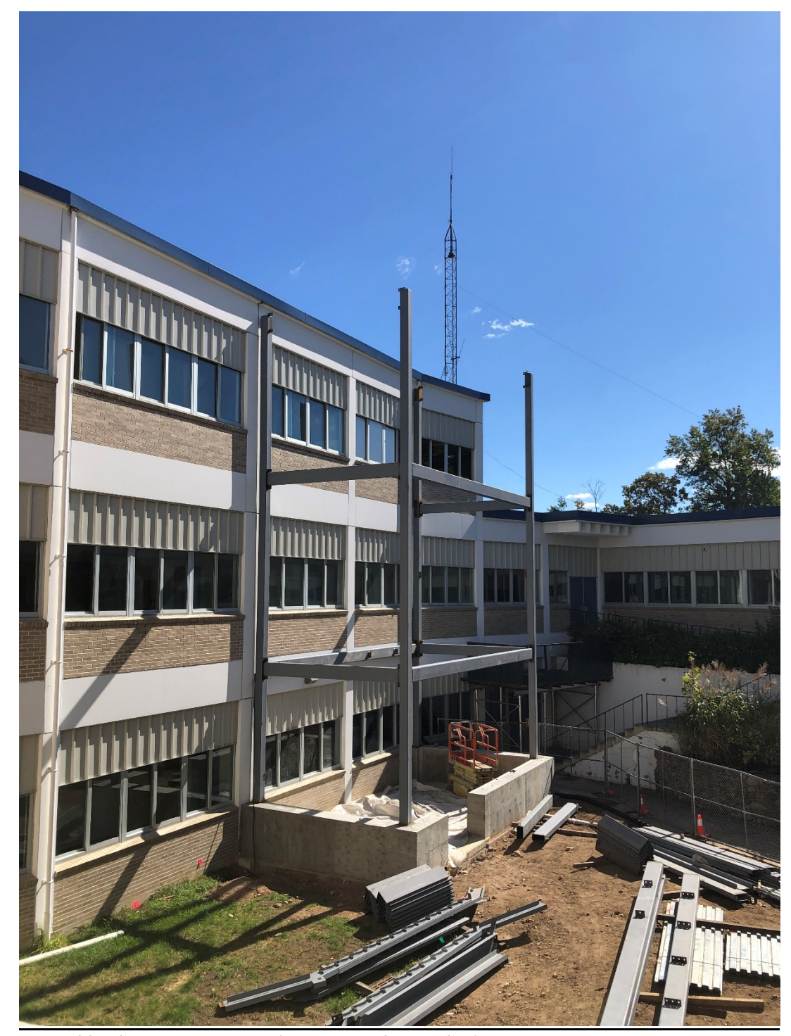
Week 20 – Structural steel being erected for the Stair Tower