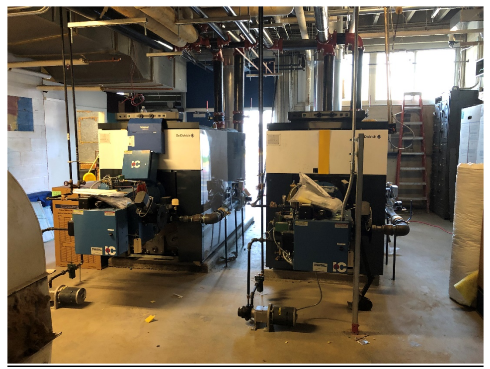
Week 21 – New Boilers being prepared for start-up