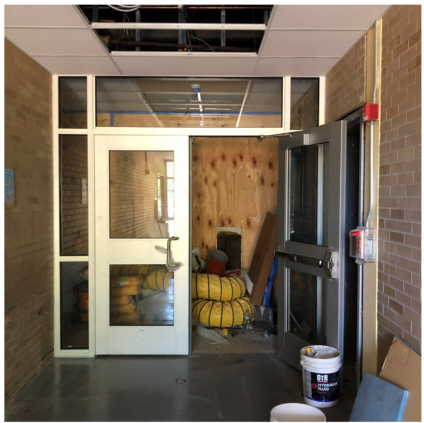
Week 20 – Inner Storefront Doors installed for the Security Vestibule