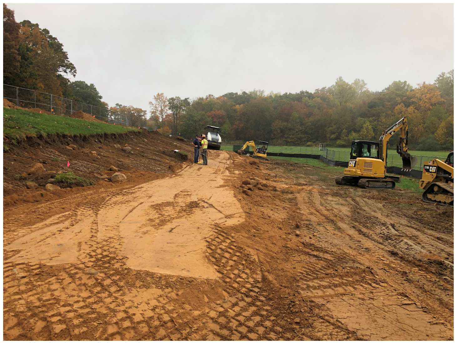
Week 22 – Cutting and filling site for proposed access road