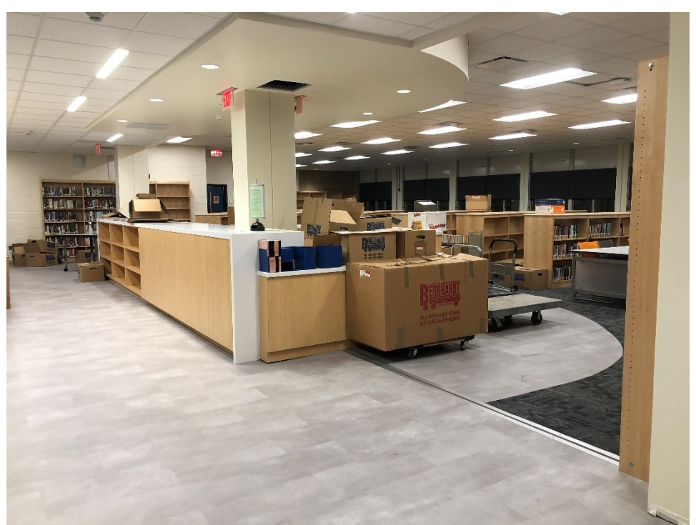
Week 22 – Flooring installed in the areas adjacent to the expansion joint assembly in the Library

Weekly Updates – Week 22 (October 19 thru October 23, 2020)