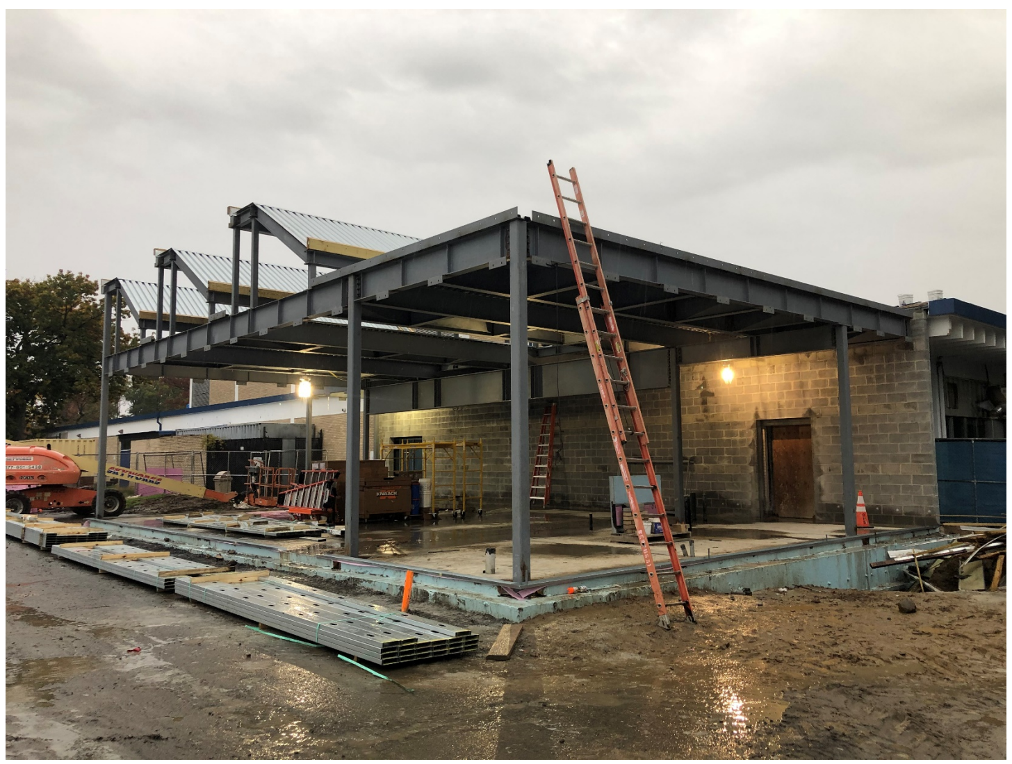
Week 23 -CMU block wall along the existing building finished at the Art Room addition

Weekly Updates – Week 23 (October 26 thru October 30, 2020)