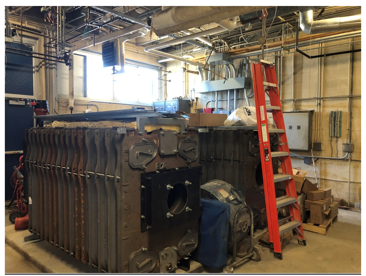
Week 20 - New Boilers being installed