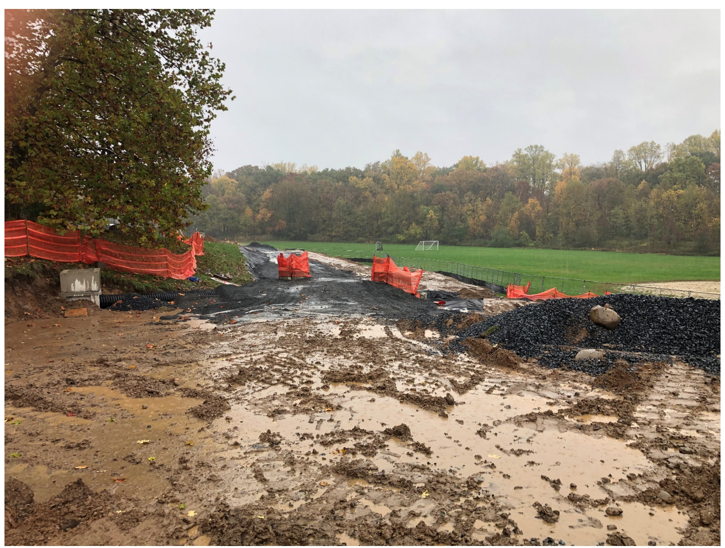
Week 23 – Progress of the work for the access road along with some drainage structures in place (wrapped by the orange safety fencing)