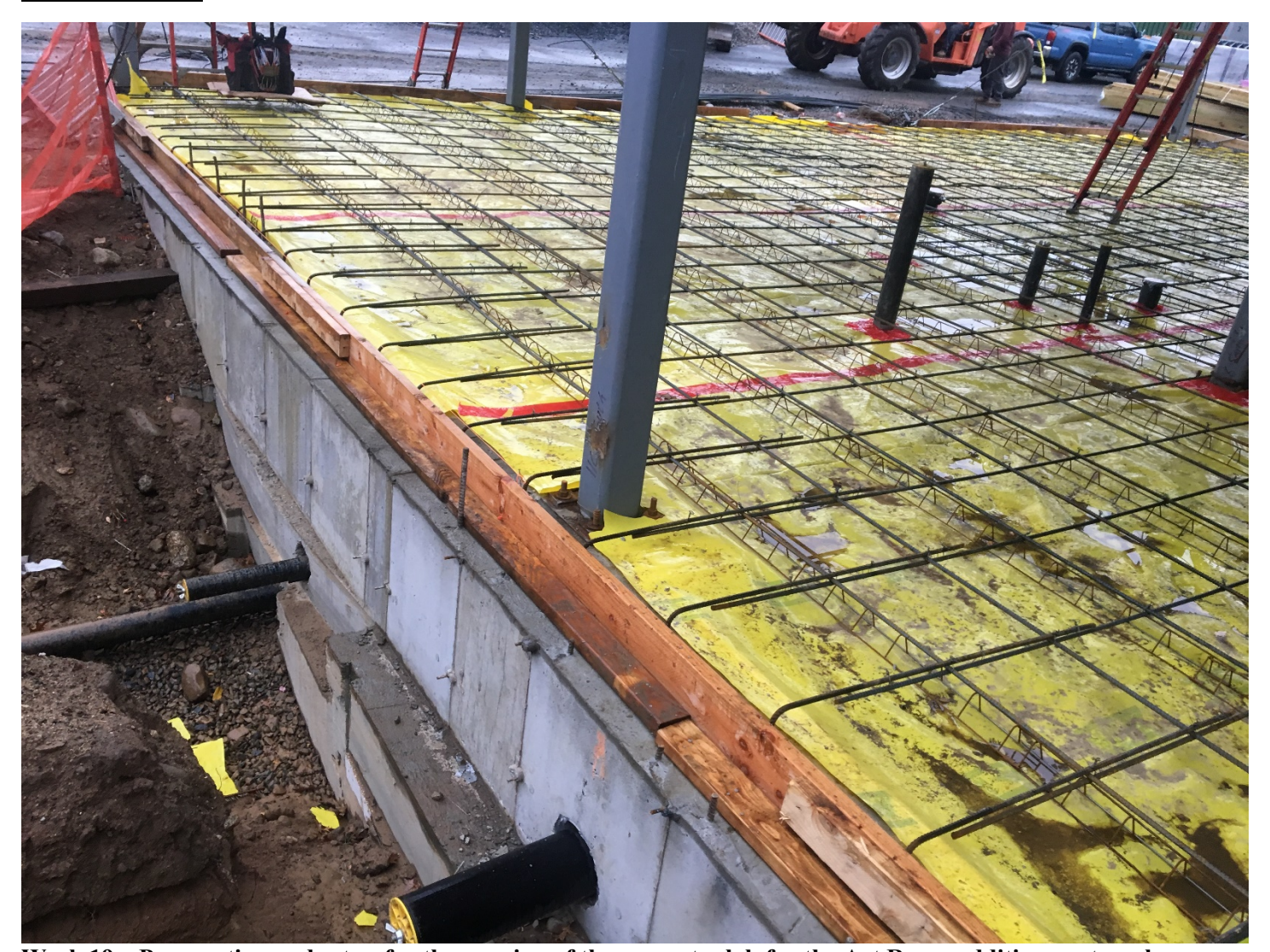
Week 19 – Preparation and setup for the pouring of the concrete slab for the Art Room addition next week

Weekly Updates – Week 19 (September 28 thru October 2, 2020)