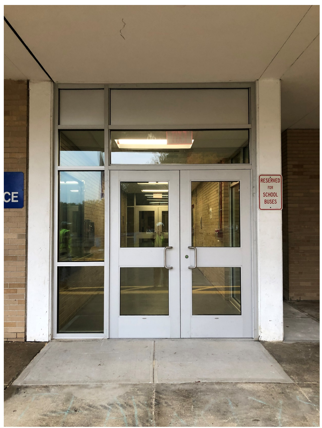
Week 22 – Exterior storefront entrance ready for egress use