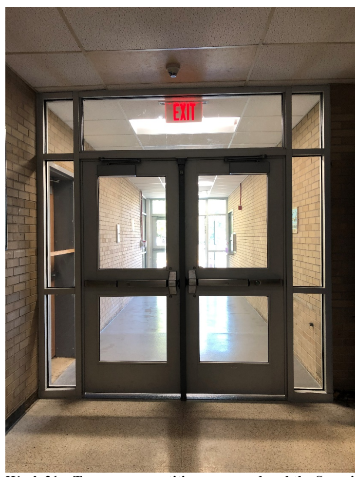
Week 21 – Temporary partitions removed and the Security Vestibule being prepared for turnover