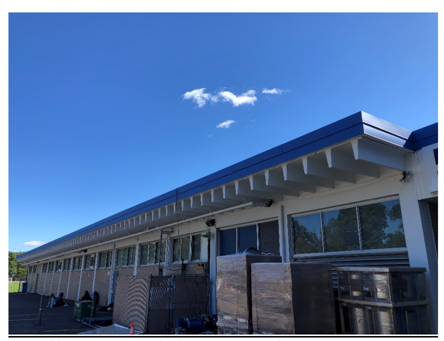
Week 20 – Blue metal trim installed on roof edge over Boy's Locke Room