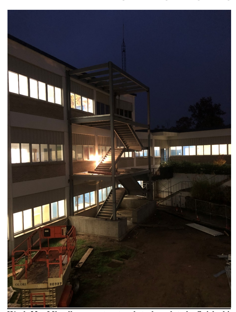
Week 22 – Miscellaneous structural steel work to be finished in the next few days