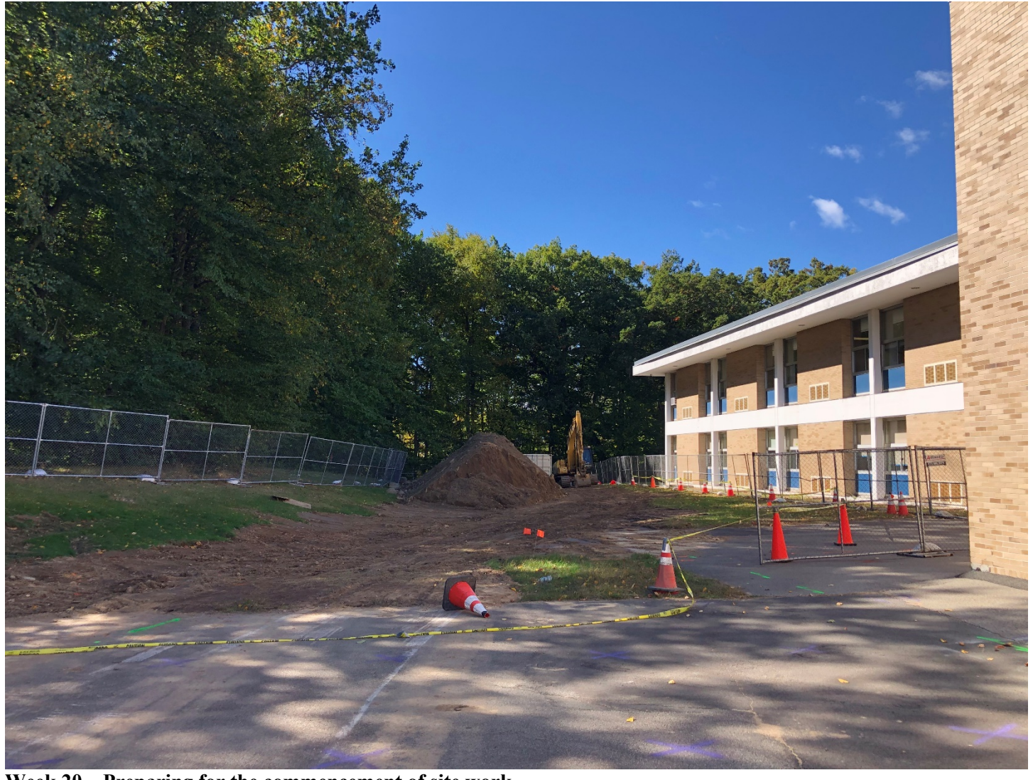
Week 20 – Preparing for the commencement of site work