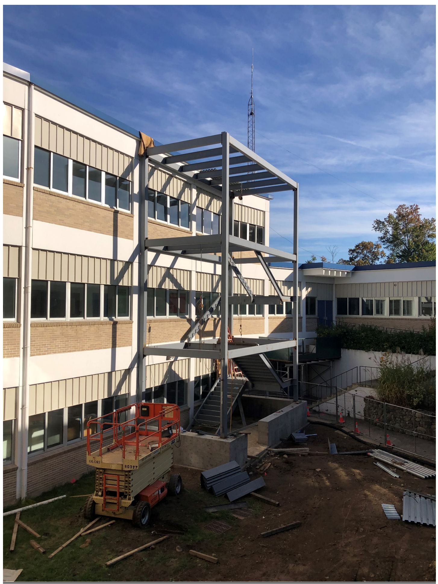
Week 21 – Structural steel framing completed and stairs being erected for the Stair Tower