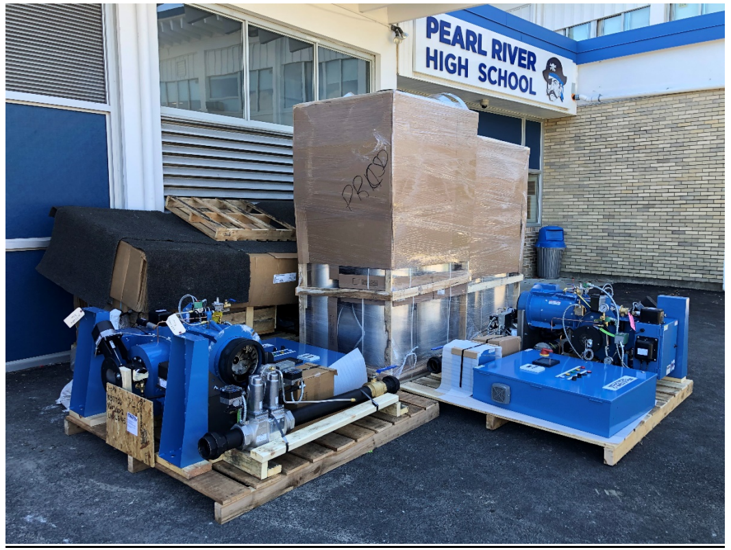
Week 20 – New mechanical equipment arriving on site