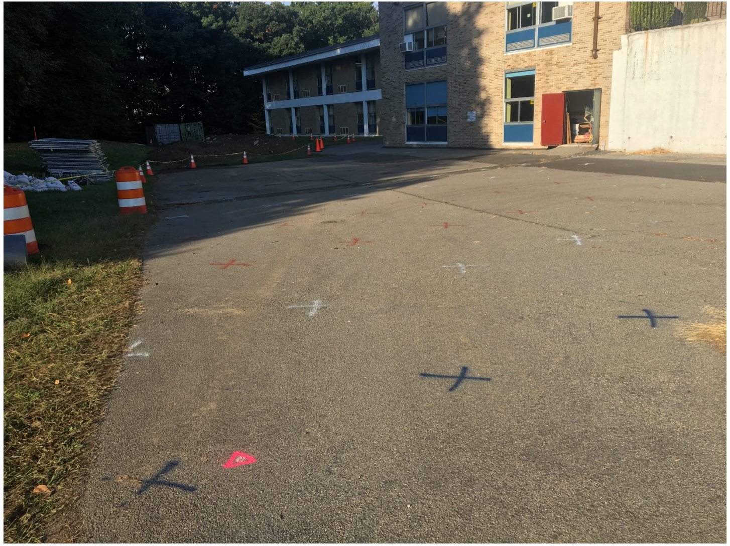
Week 19 – Mobilization of the site with some markouts for existing underground utitlies on the pavement