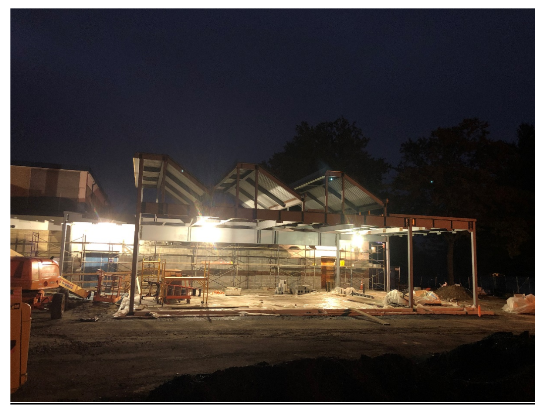
Week 22 -CMU block wall along the existing building nearing completion