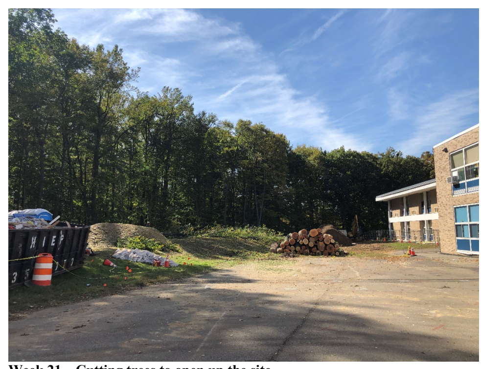
Week 21 – Cutting trees to open up the site