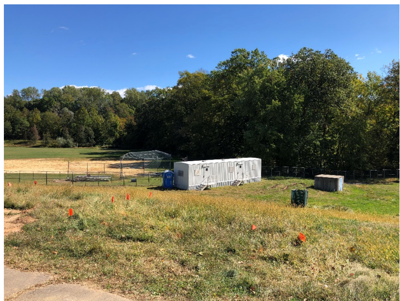
Week 20 - Construction Trailer for Owner / Architect / CM on site