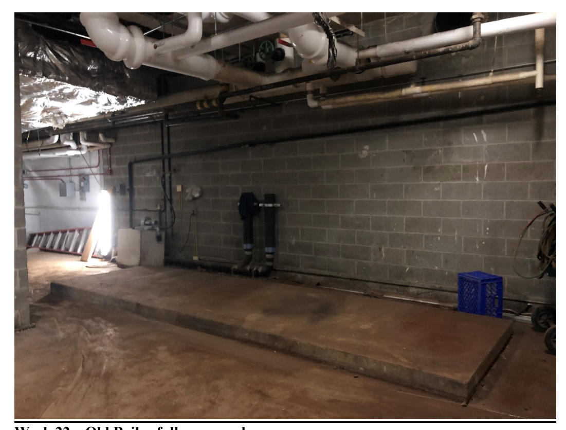
Week 22 – Old Boiler fully removed