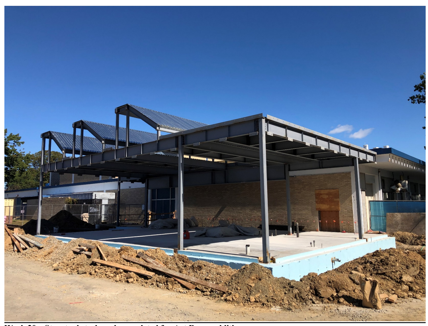
Week 20 – Structual steel work completed for Art Room addition