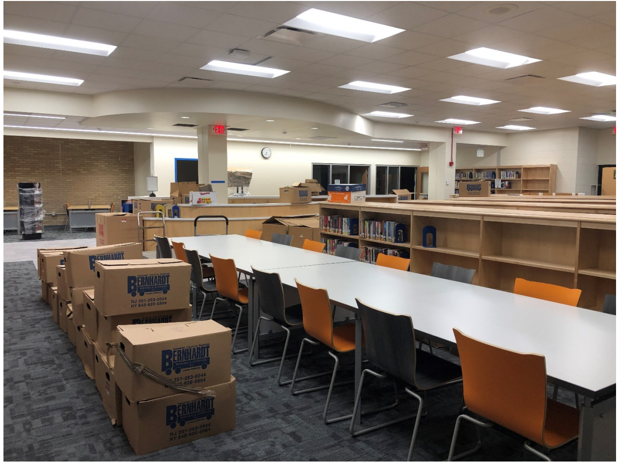
Week 22 – Furniture in place in the Library