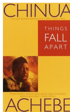
Things Fall Apart – Chinua Achebe

Junior honors students are required to read both books over the summer.