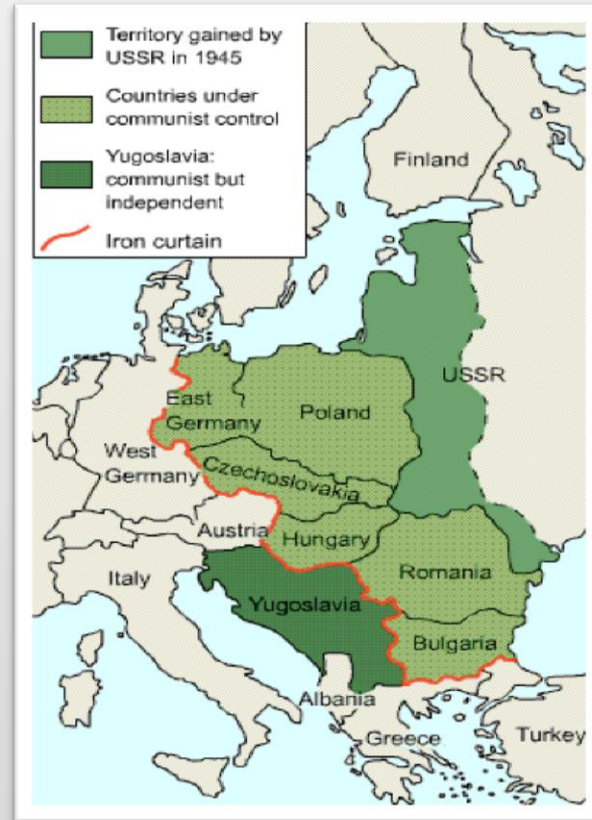
Map of the Iron Curtain

The Iron Curtain was the physical boundary dividing Europe into two separate areas from the end of World War II in 1945 until the end of the Cold War in 1991.