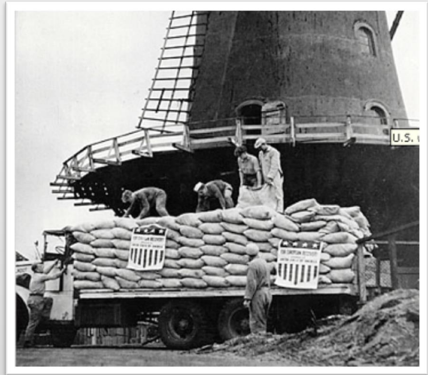
Photo shows a delivery of wheat from the U.S. being unloaded in Rotterdam, Netherlands

A map showing how the plan's $20B was distributed by country Look up Marshall Plan