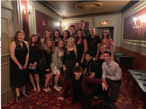
WHS Theatre department had an impressive evening at the Halo Awards in May!