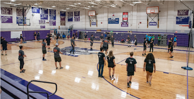
WHS Teen Leadership participated at the Project Courage Volleyball charity event!