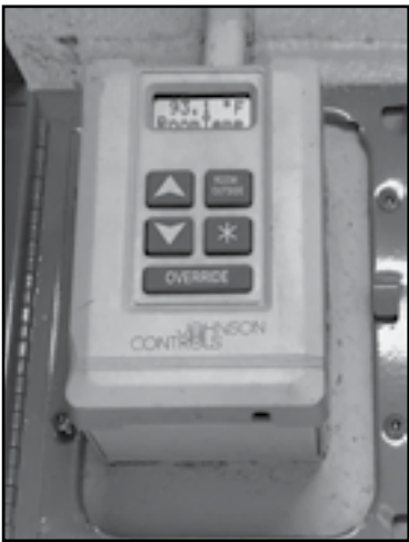
A thermostat seen on the third floor was seen reading 93 degrees fahrenheit.

Students and staff in Queens Tech experienced extremely high temperatures in their classrooms during the winter season because the heater was left on.