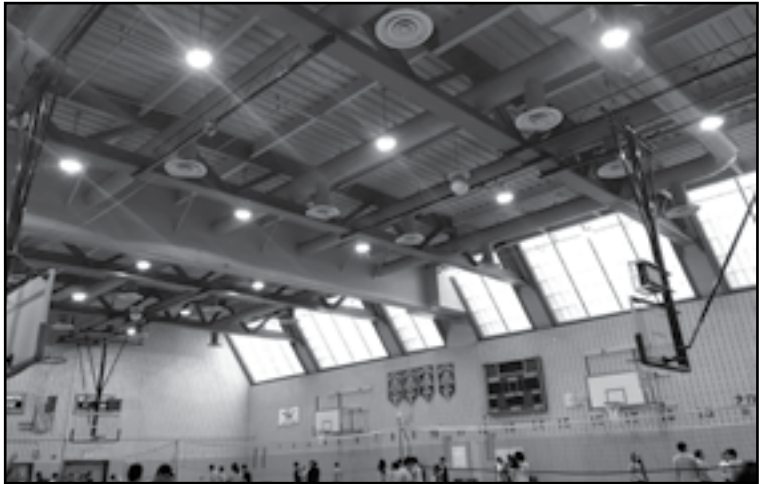
The Department of Education covered the expenses of the new gym lights.

Between Jan 21 through Jan 28, Queens Tech made enlightening changes to the gymnasium and locker rooms. The school has replaced the lights causing it to become brighter.