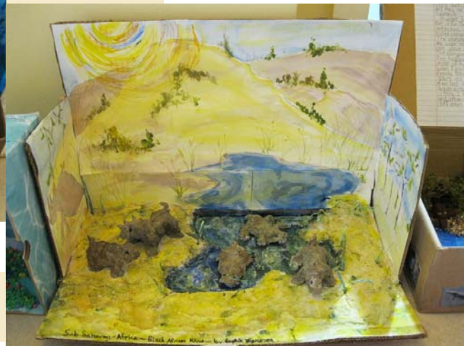
LEFT: PROJECT BY: SOPHIA FIGUEROA RM. 201