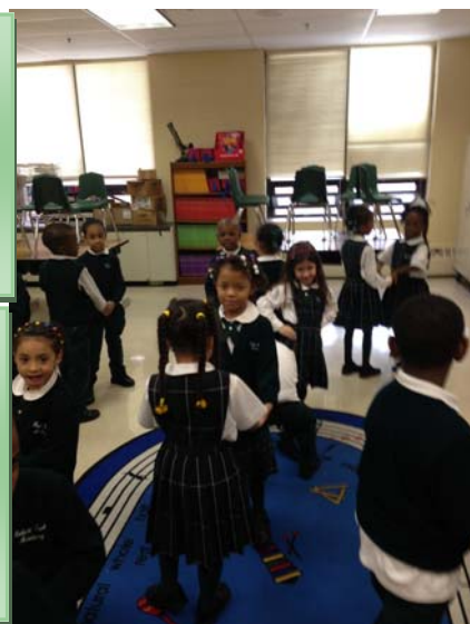
PICTURED RIGHT: STUDENTS SINGING A PARTNER SONG