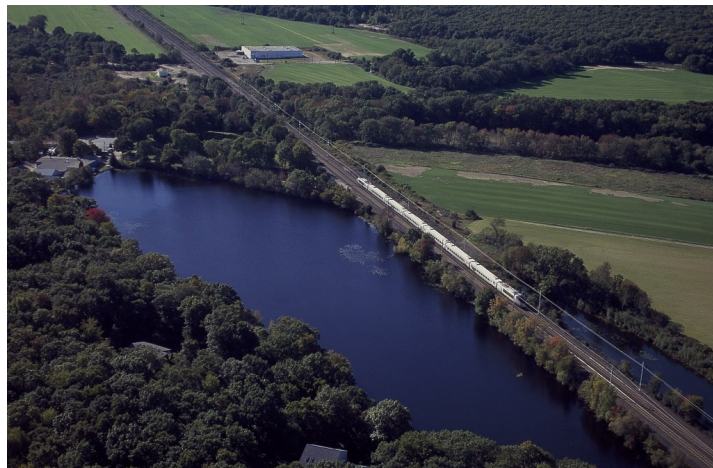
The Amtrak Acela High-speed train doing a test run through New England before it is put in service [1980]

What was travel like at the beginning of the twentieth century as compared to travel today? Specifically, what was it like to travel by train?