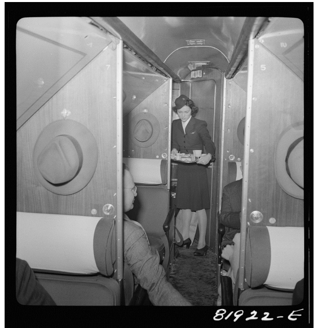
Stewardess serving dinner aboard an American airliner enroute from Washington to Los Angeles [1941]