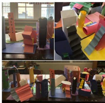
1-204 Construction Paper, Scissor and Tape Constructions-Designing an Urban Utopia.

We are continuing our Urban Utopia Unit, where students look at works by architects Zaha Hadid, (Iraqi/British), and Friedensreich Hundertwasser, (Austrian), as well as artworks by Bodys Isek Kingelez, (Belgian Congo, Africa), who created fantastic maquettes for buildings. Students will be brainstorming ideas about what an Urban Utopia might include. To start, students will be drawing building ideas considering both form and function. They will learn how to take a 2-D piece of paper and transform it into a 3-D building, and then they will work as architects in small groups designing a specific building for our First Grade Urban Utopia .