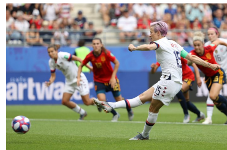
Megan Rapinoe scored a penalty kick goal to help the US beat Spain yesterday.