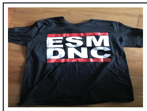
6 th Grade Dance Showcase T-Shirt

people that want to observe, the dancing that students were preparing for all school year. From learning their first piece of Youngblood , to learning the finale of Viva la Vida , the 6th graders had a great dance year, and the 8th grade ballroom dancers learned many new partner dance steps that could change everyone's lives.