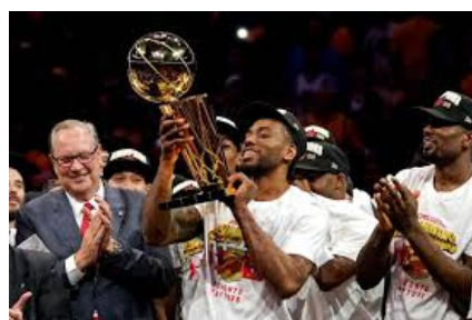
The St. Louis Blues (top) and the Toronto Raptors celebrate their NHL and NBA victories by holding the league trophies.

games, but the one that beats them all was USA vs Thailand. The USA beat Thailand 13-0. Through today, the US women have only given up a single goal in their World Cup matches! They play France in the quarter finals on Friday. Absolutely amazing games have happened this month, a fantastic way to promote women's soccer. Tune into Fox or FS1 to watch ESPN CNBC