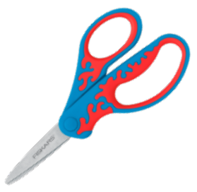
1 pair of scissors blunt tip, metal blades