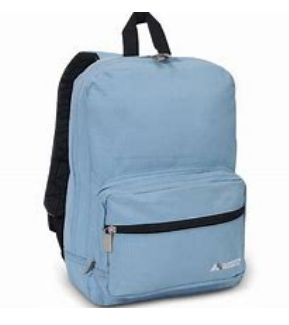
Backpack large enough to fit a folder (please label)