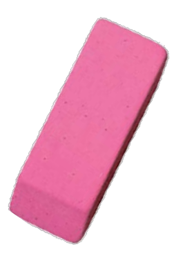
1 pink eraser