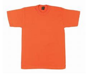
1 oversized art shirt (please label)