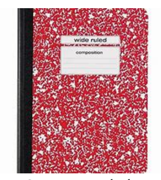
2 Composition Notebooks1 black, 1 red, wide ruled