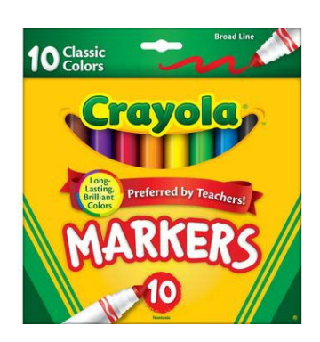
1 pack of 10 <u>Crayola</u> markers broad line, classic colors