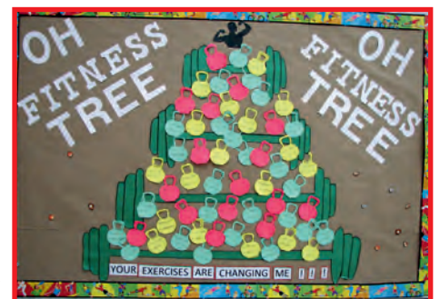
"Oh Fitness Tree"