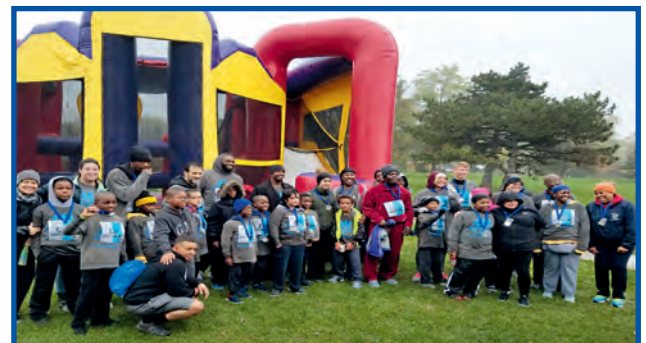
The Flossmoor Hills' Xtreme Boys Running Club completes a 5k with family and friends at Apollo Park