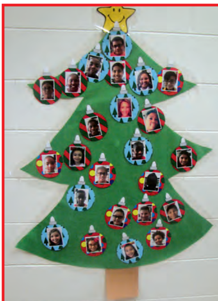
"Deck the Halls With Team Ski"