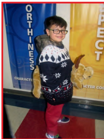
"This Little Elf is Ready for the Holiday Season"