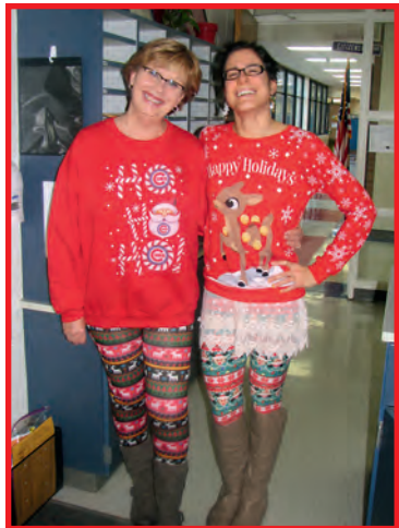
"Wear Red Day with Mentor and Mentee"