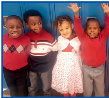
Kindergarten students are ready to sing at their Winter Concert on December 13th