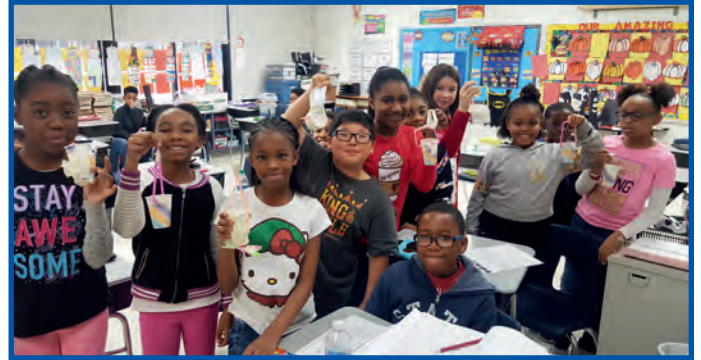
Students show their STEAM (Science, Technology, Engineering, Arts, Mathematics) projects