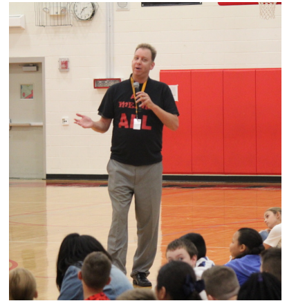
Students from around District 194 participate in activities that build confidence and character.