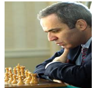
Gary Kasparov is considered one of the best chess players of all time. He was the World Champion for over 18 years!