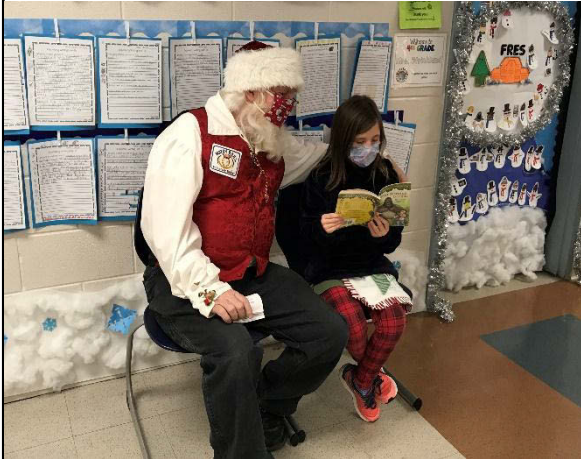
Watch Dog joining the FRES spirit week festivities and reads with his grand-daughter.

• We excitedly welcomed our dads to the Watch Dog Orientation Night on December 9 th . The following week fathers of FRES students volunteered their time and spent an entire day at FRES.