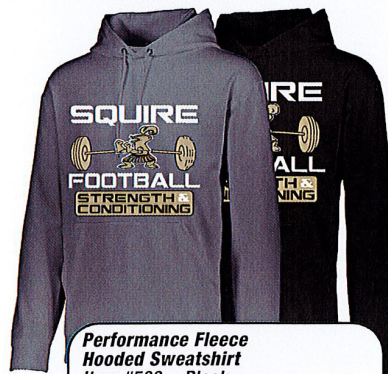
Item #500 = Black Item #550 = Graphite Available in: Youth M-XL, Adult S-3XL Price = $37.00