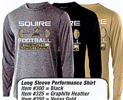
Item #300 = Black Item #325 = Graphite Heather Item #350 = Vegas Gold Available in: Youth M-XL, Adult S-3XL Price = $25.00