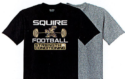
Item #100 = Black Item #150 = Graphite Heather Available in: Youth M-XL, Adult S-3XL Price = $15.00