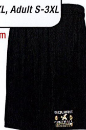
Item #900 = Black Available in: Youth S-XL, Adult S-3XL Price = $24.00