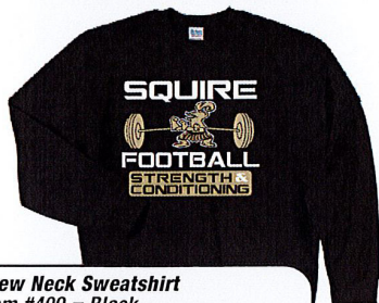
Item #400 = Black Available in: Youth M-XL, Adult S-3XL Price = $22.00