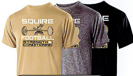
Item #200 = Black Item #225 = Graphite Heather Item #250 = Vegas Gold Available in: Youth M-XL, Adult S-3XL Price = $21.00