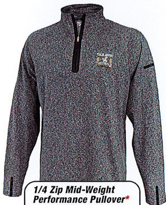
1/4 Zip Mid-Weight Performance Pullover* Item #700 = Grey/Black Available in: Adult XS-3X Price = $37.00