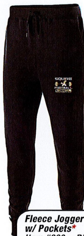
Item #800 = Black Available in: Youth S-XL, Adult XS-3XL Price = $32.00