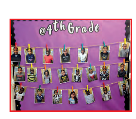
"If you want to go fast – go alone, if you want to go far – go together" – African Proverb