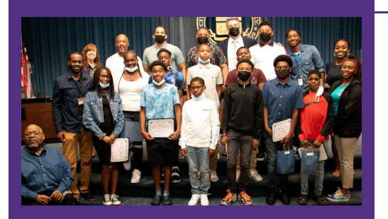
Participants in the new partnership.

of a former white supremacist and also from a Holocaust survivor. Students selected to participate were encouraged to share what they learned with their peers and the community.