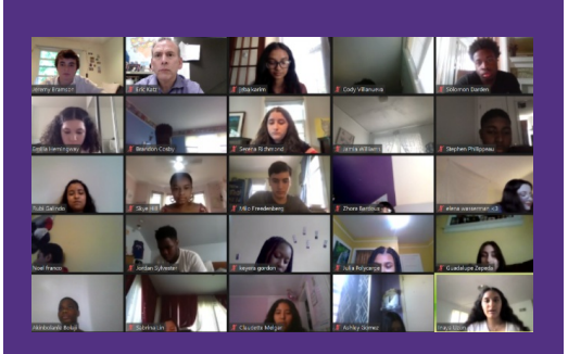
Some of the participants in the Human Rights forum.

For an overview of the Districtwide schedule, click on the image above. For details about New Rochelle High School's graduation, <u>click here</u>.