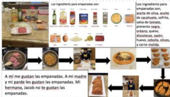
At home cooking opportunities