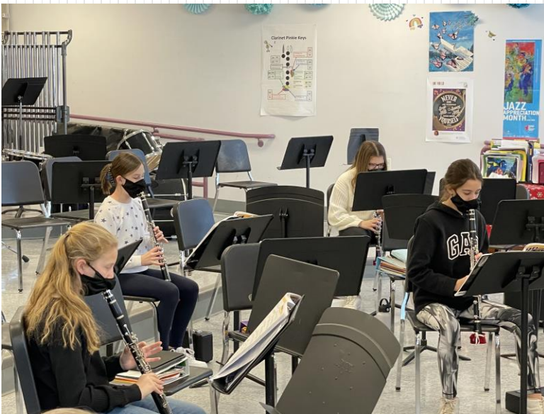
6th Grade Clarinet Lesson