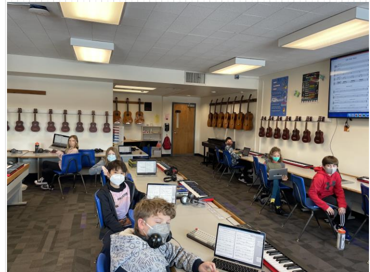
Discovering Music (Music Technology)