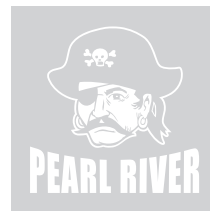
White Pirates Window Decal $6

*You can add a # to any of these sports decals. It will appear below the design except for the football design which will have it inside. If you would like two #s they will be placed on each side. A third # would go underneath.