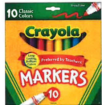
1 pack of 10 Crayola markers broad line, classic colors