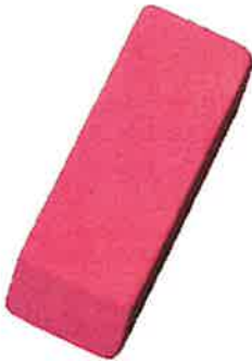
1 pink eraser