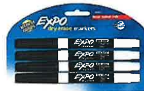
8 EXPO brand dry erase markers thin tip ( BLACK only, no ultra fine tip)