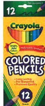
1 pack of 12 Crayola colored pencils