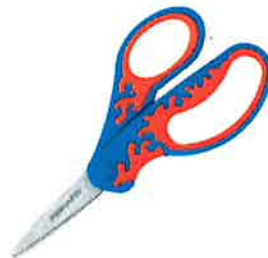
1 pair of scissors blunt tip, metal blades