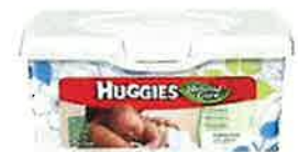
1 container of unscented baby wipes