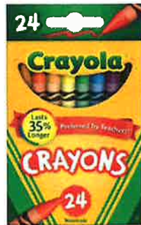
4 packs of 24 Crayola Crayons