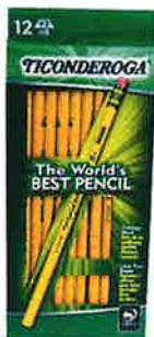
12 yellow pencils