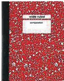
2 Composition Notebooks 1 black, 1 red, wide ruled

Please provide the following supplies to be used at school. Please DO NOT label the supplies. Continued on reverse side.