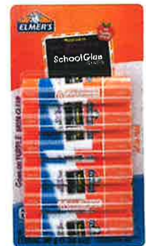
16 Elmer's brand glue sticks