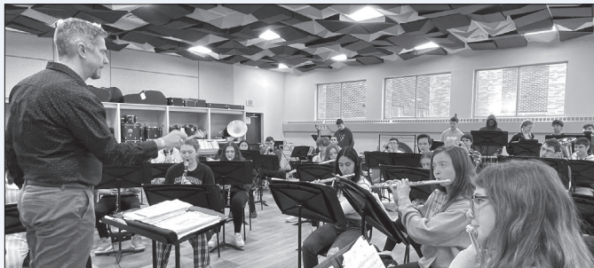
The Mahopac Central School District offers a wide array of musical ensembles, including the Philharmonic Orchestra, String Sinfonietta, Chorus, Wind Ensemble & Symphonic Band. Mahopac was selected as one of the Best Communities for Music Education in 2021 by the NAMM Foundation. The renovated MHS music wing offers spacious, soundproof music and chorus rooms, professional-grade practice studios and climate-controlled storage cubbies that protect the instruments.