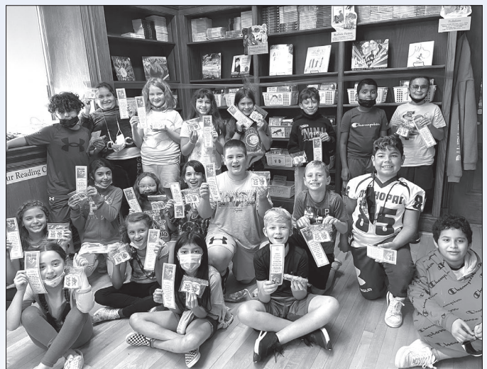
A classroom library stocked with high-interest books in a range of reading levels is the bedrock of the Mahopac schools' elementary reading program. Every classroom in the district's three elementary schools offers young readers a wide selection of books to teach the love of reading.