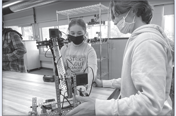
Mahopac High School students practice coding and machine control in the Principles of Engineering class, one of several college-level engineering courses that are taught in the high school's new STEM area, which is designed to prepare them for college and careers.