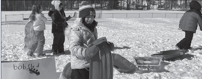
Second graders had their own Winter Olympics. They researched and wrote about countries that participated, kept track of the medal count as a math lesson and had plenty of fun.