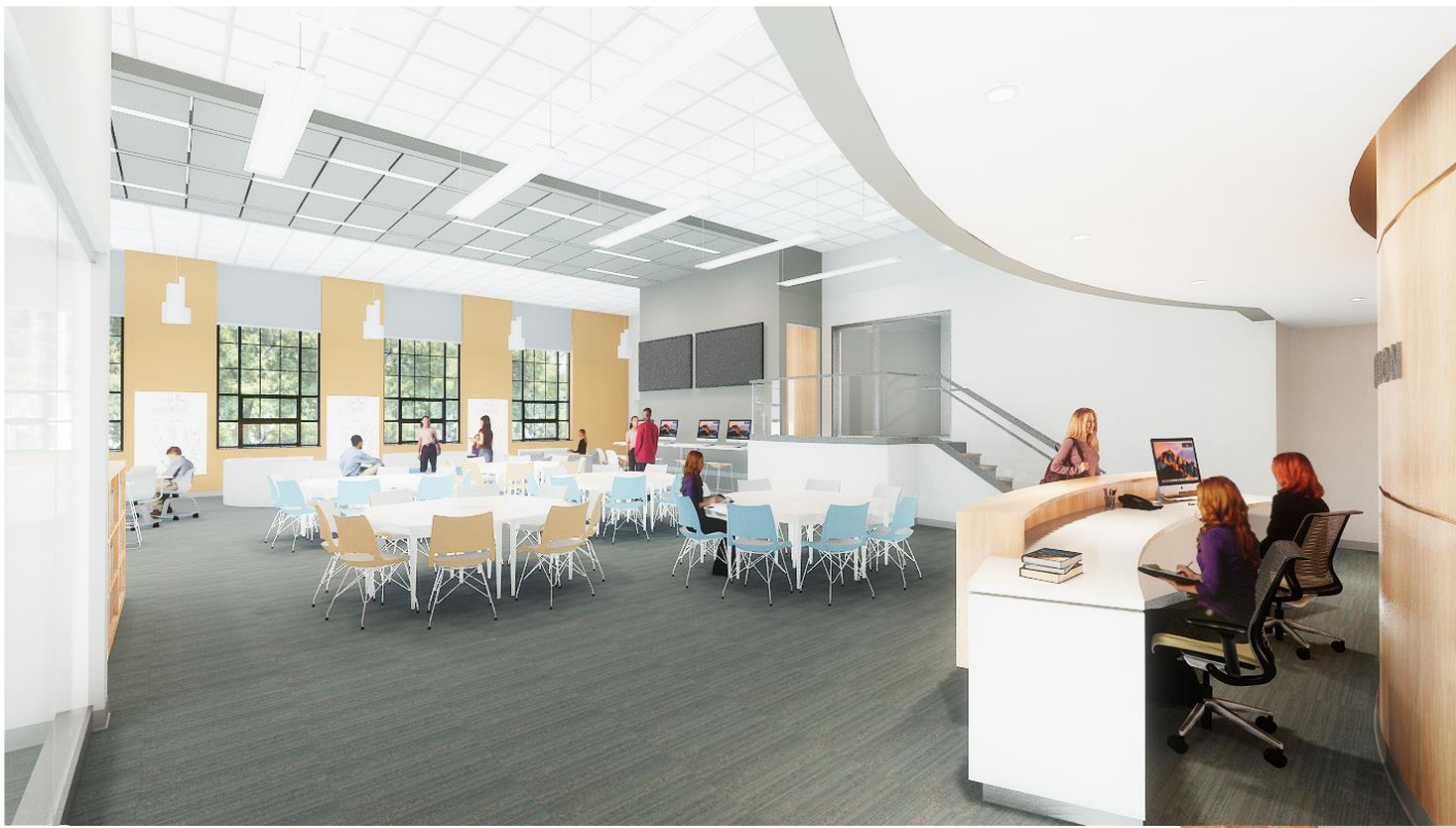
MIDDLE/HIGH SCHOOL PROPOSED LIBRARY INTERIOR RENDERING