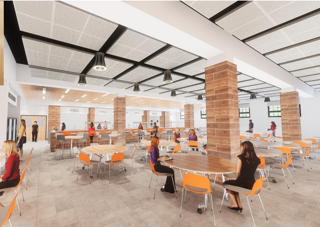
MIDDLE/HIGH SCHOOL PROPOSED CAFETERIA INTERIOR RENDERING