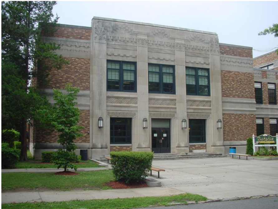
MIDDLE / HIGH SCHOOL