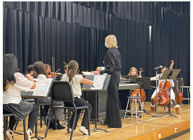
Band and Orchestra Concerts