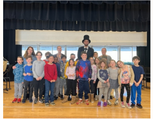
3rd Grade Writing Celebration & Abe Lincoln Visits 2nd Grade